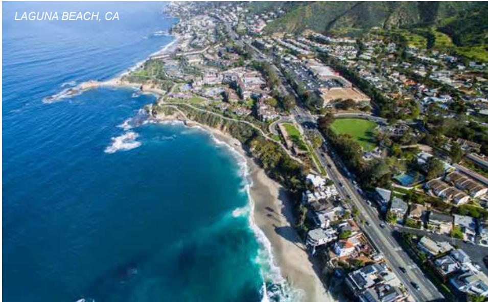
LAGUNA BEACH, CA