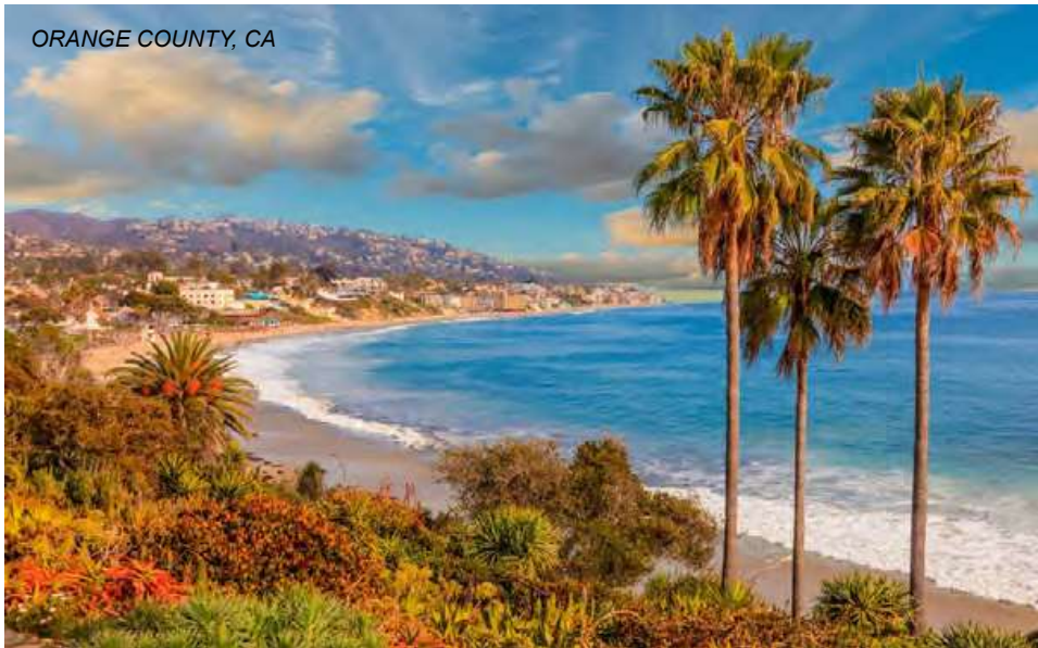
ORANGE COUNTY, CA

With limited developable land, strict zoning regulations, and strong community protections, the hospitality supply in Laguna Beach remains highly constrained, supporting long-term pricing power and stable performance for existing hotel assets.