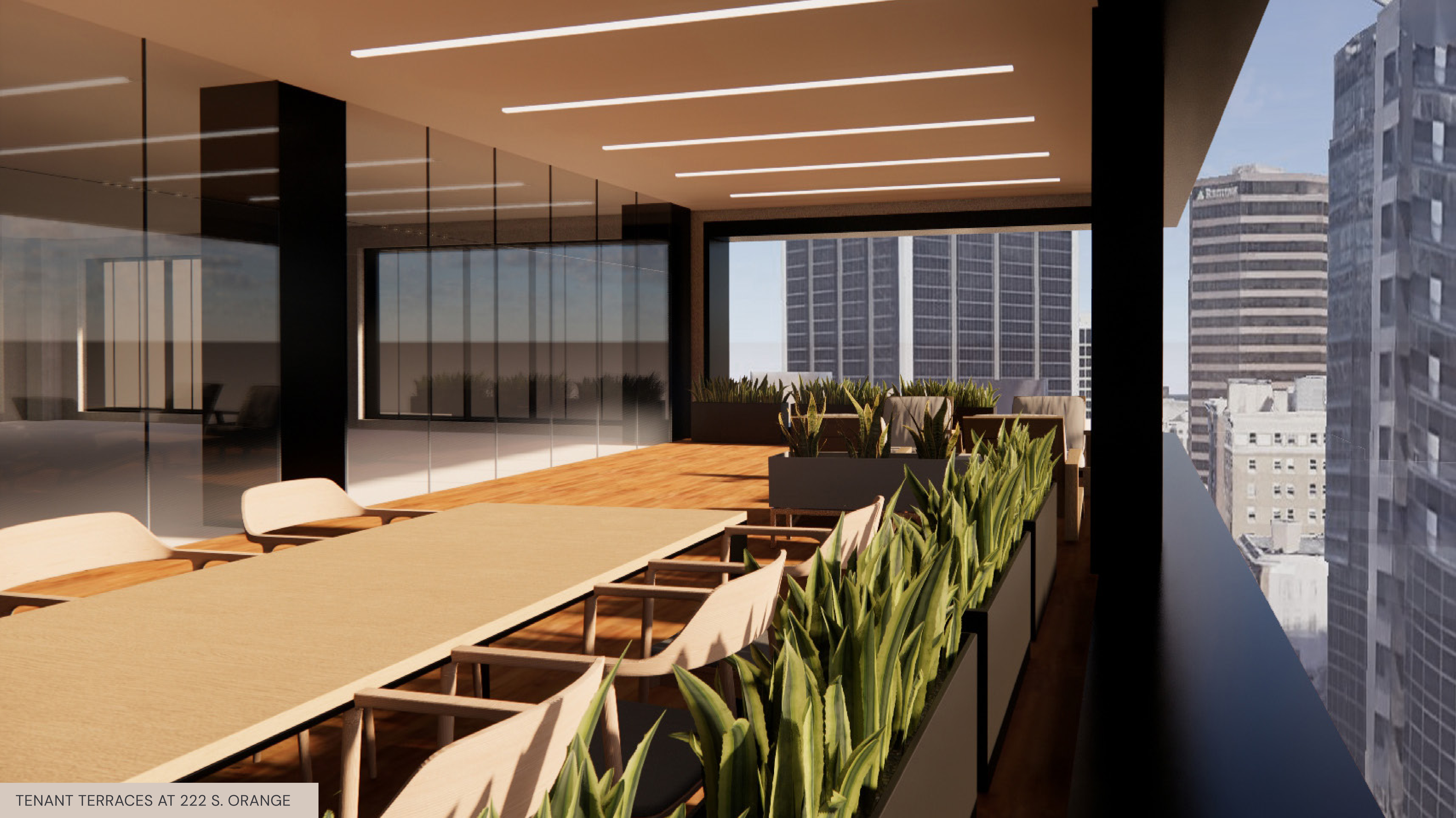
TENANT TERRACES AT 222 S. ORANGE