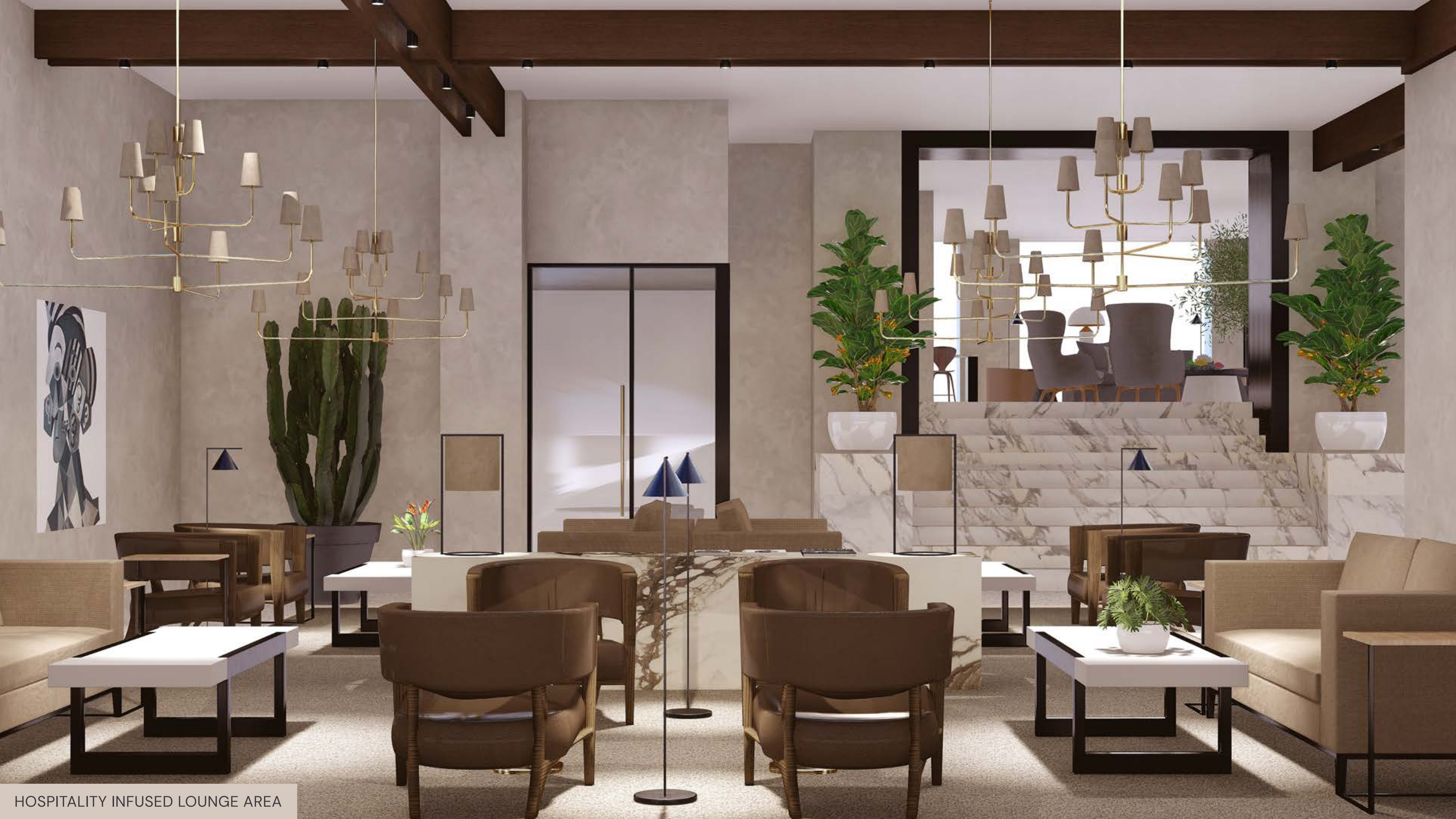
HOSPITALITY INFUSED LOUNGE AREA