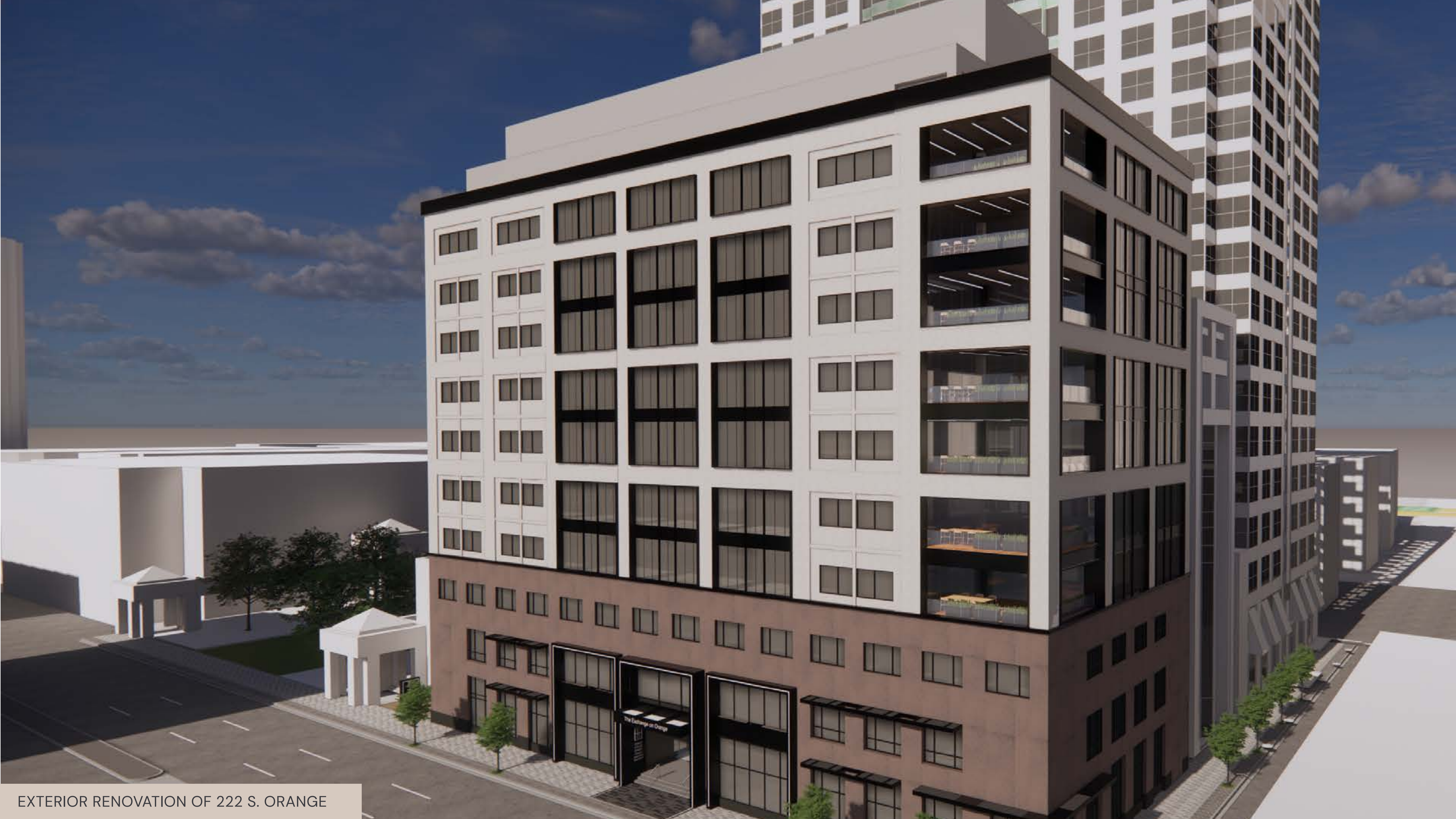
EXTERIOR RENOVATION OF 222 S. ORANGE