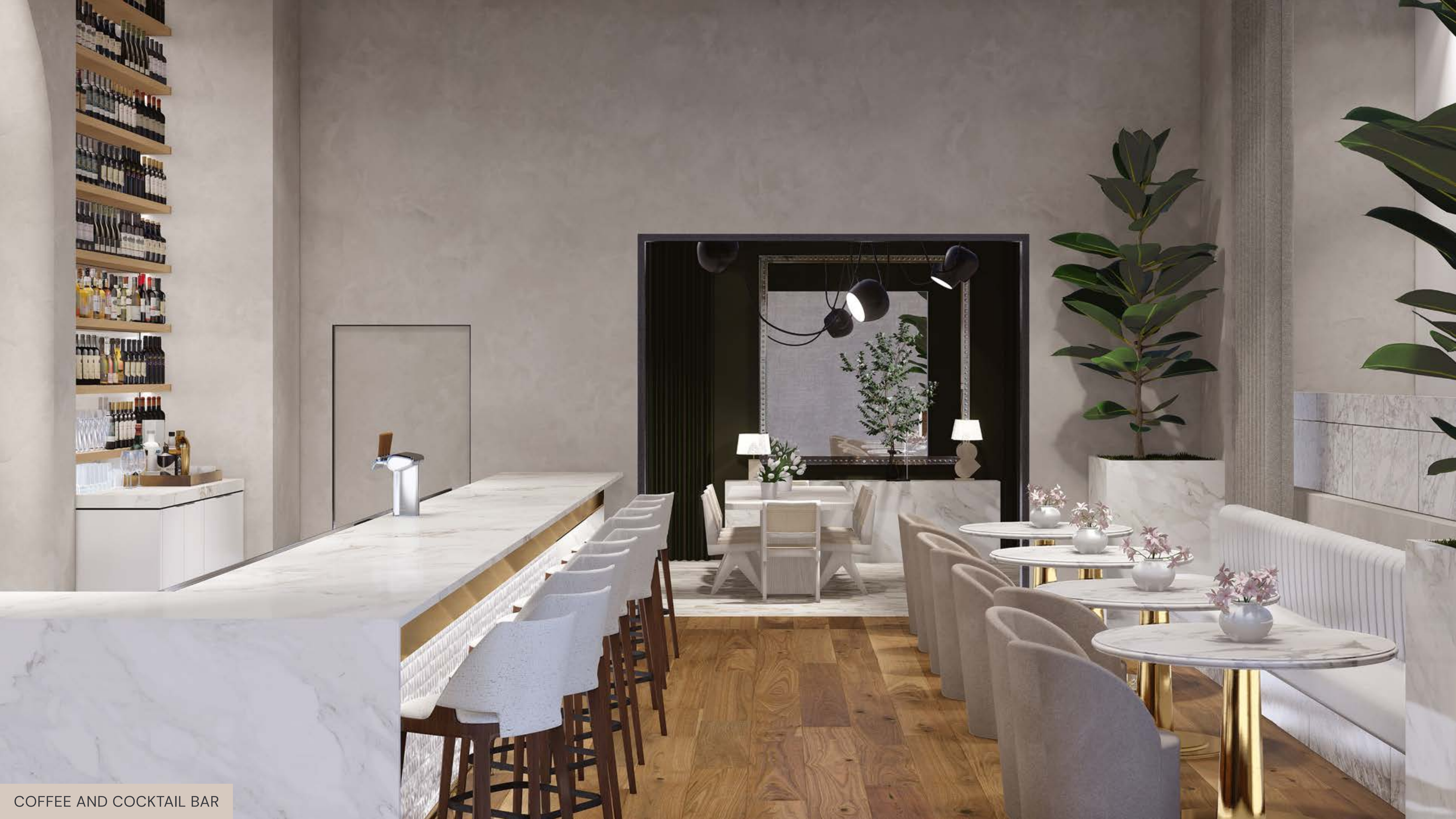
COFFEE AND COCKTAIL BAR