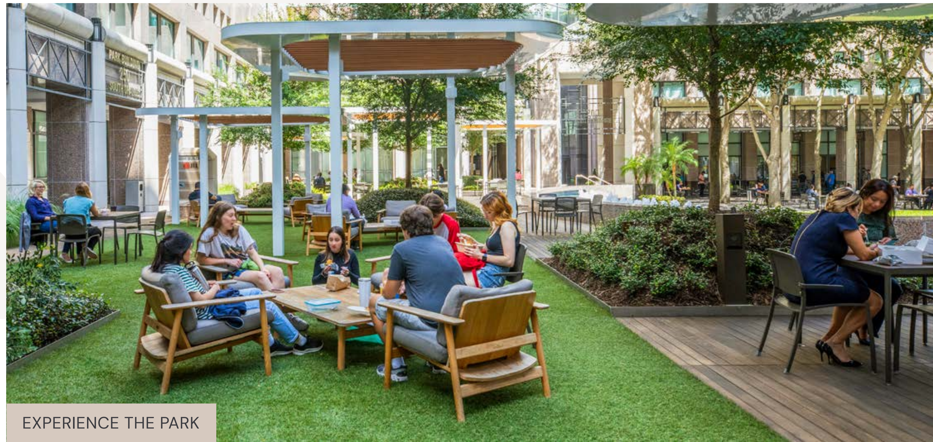
EXPERIENCE THE PARK