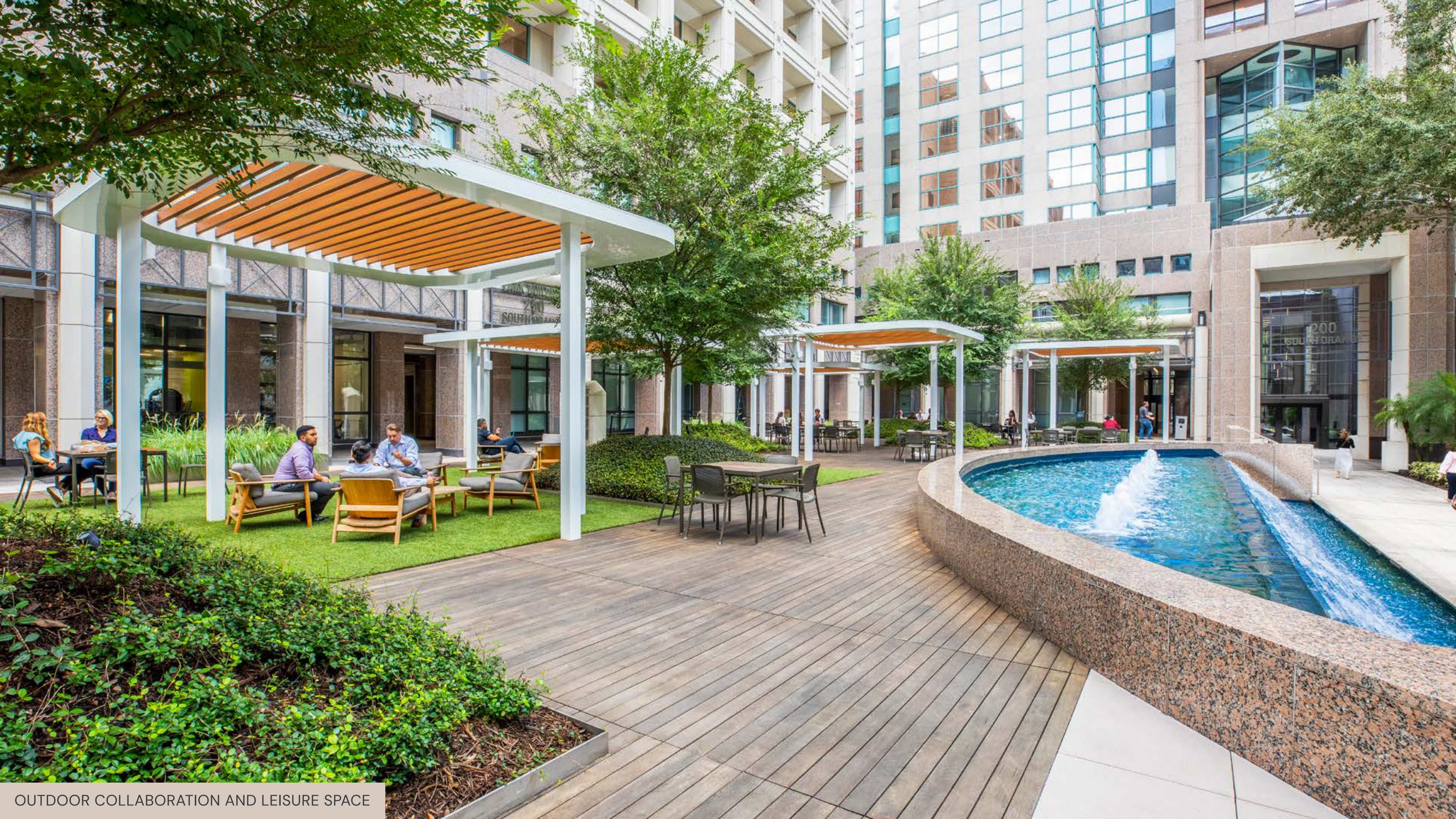
OUTDOOR COLLABORATION AND LEISURE SPACE