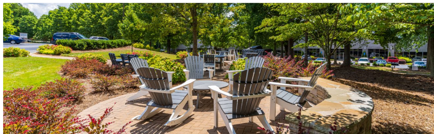
Outdoor Collaboration Areas