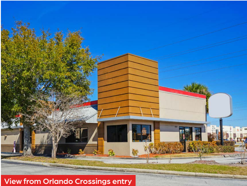
View from Orlando Crossings entry