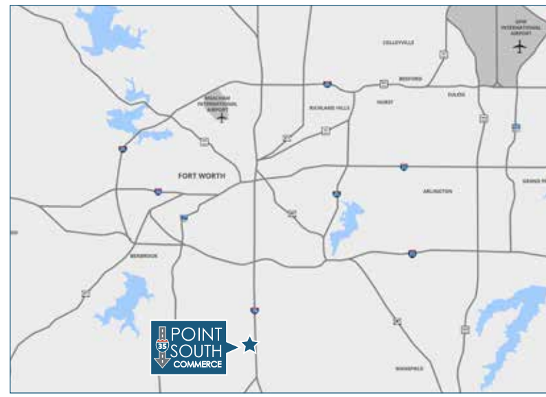
This information is deemed reliable, however Holt Lunsford Commercial makes no guarantees warranties or representation as to the completeness or accuracy thereof.