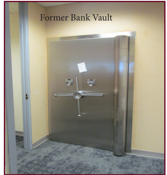
Former Bank Vault