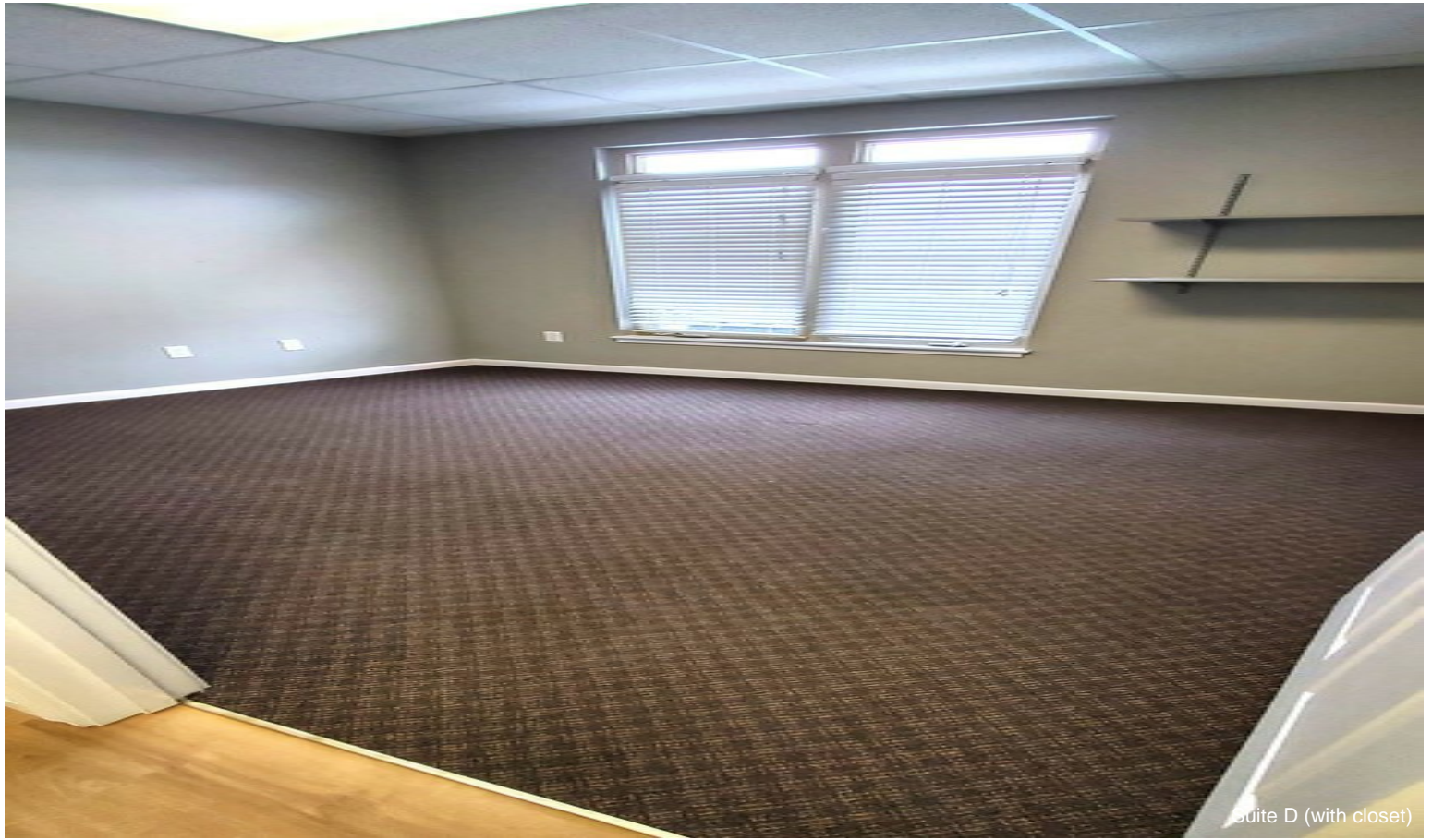
Suite D (with closet)