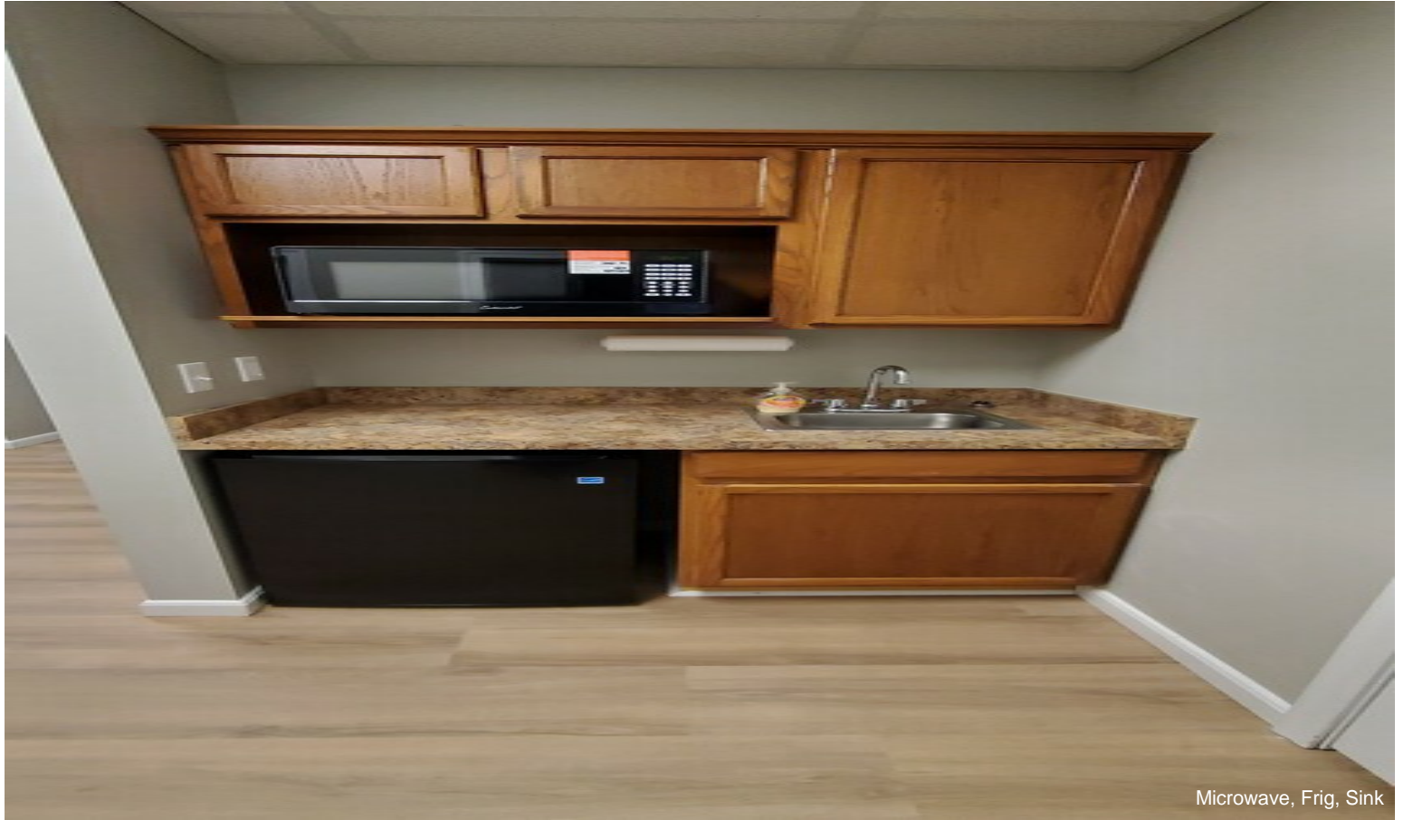
Microwave, Frig, Sink