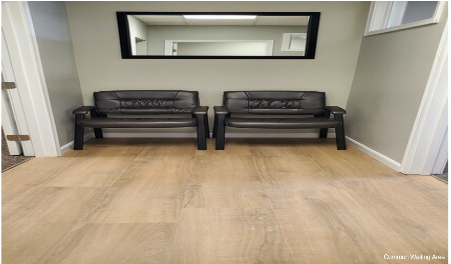
Common Waiting Area