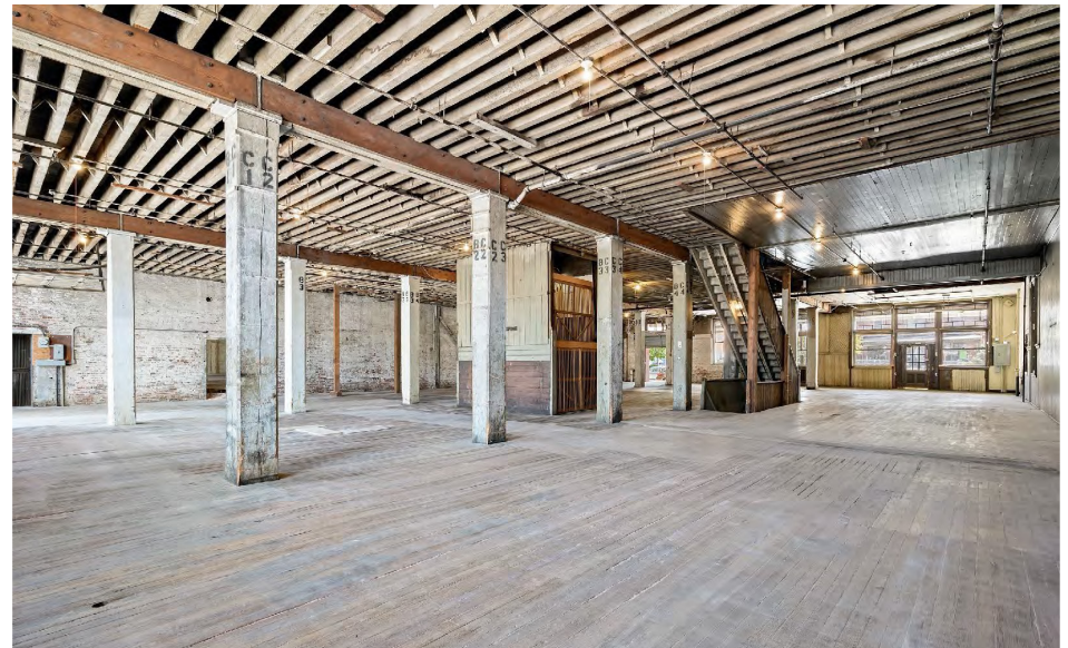
The two adjacent brick buildings are former warehouse storage buildings. The taller building includes concrete flooring, columns, and brick walls (left photos), while the shorter, older building is a wood timber structure with brick walls.