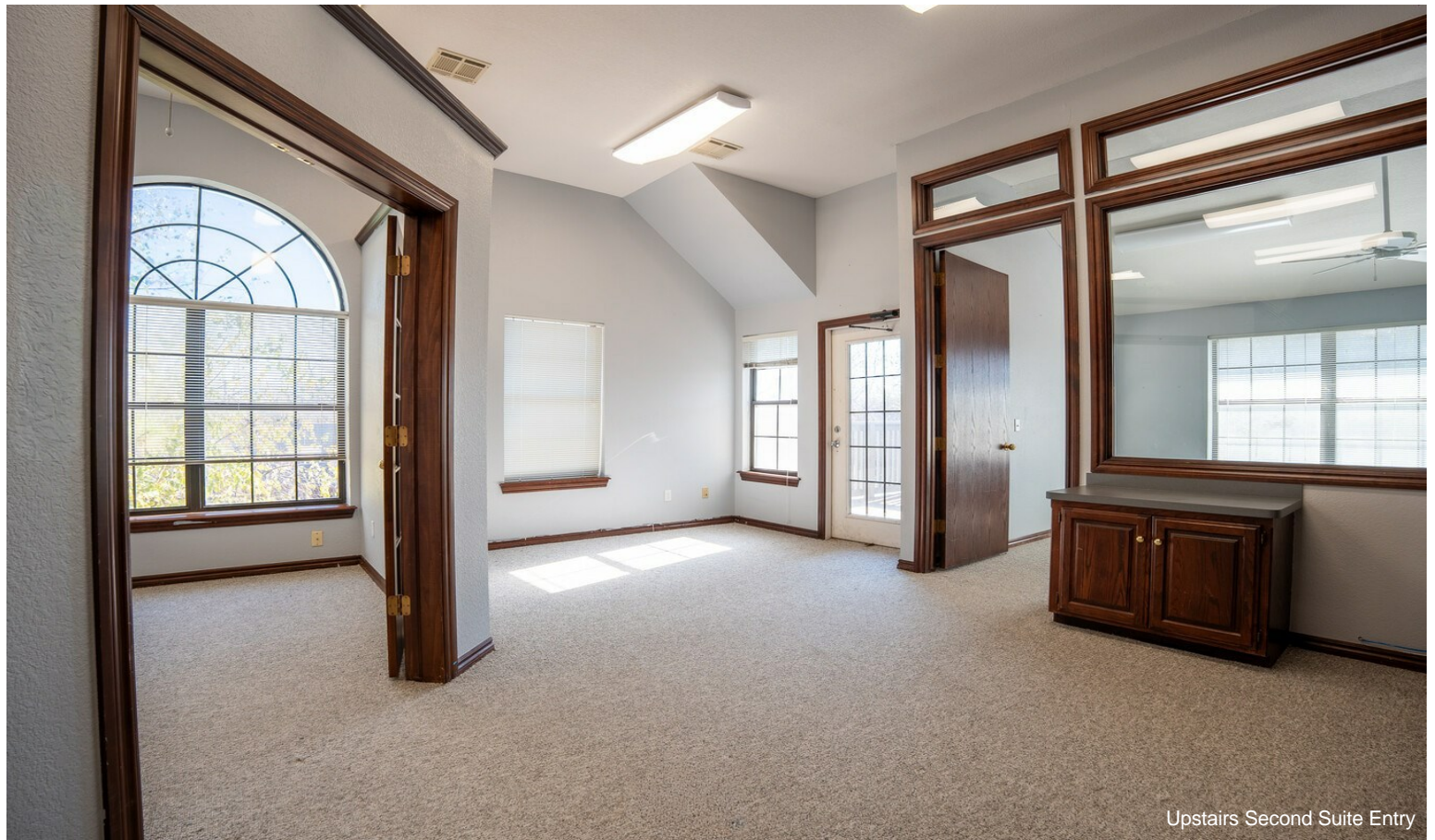
Upstairs Second Suite Entry