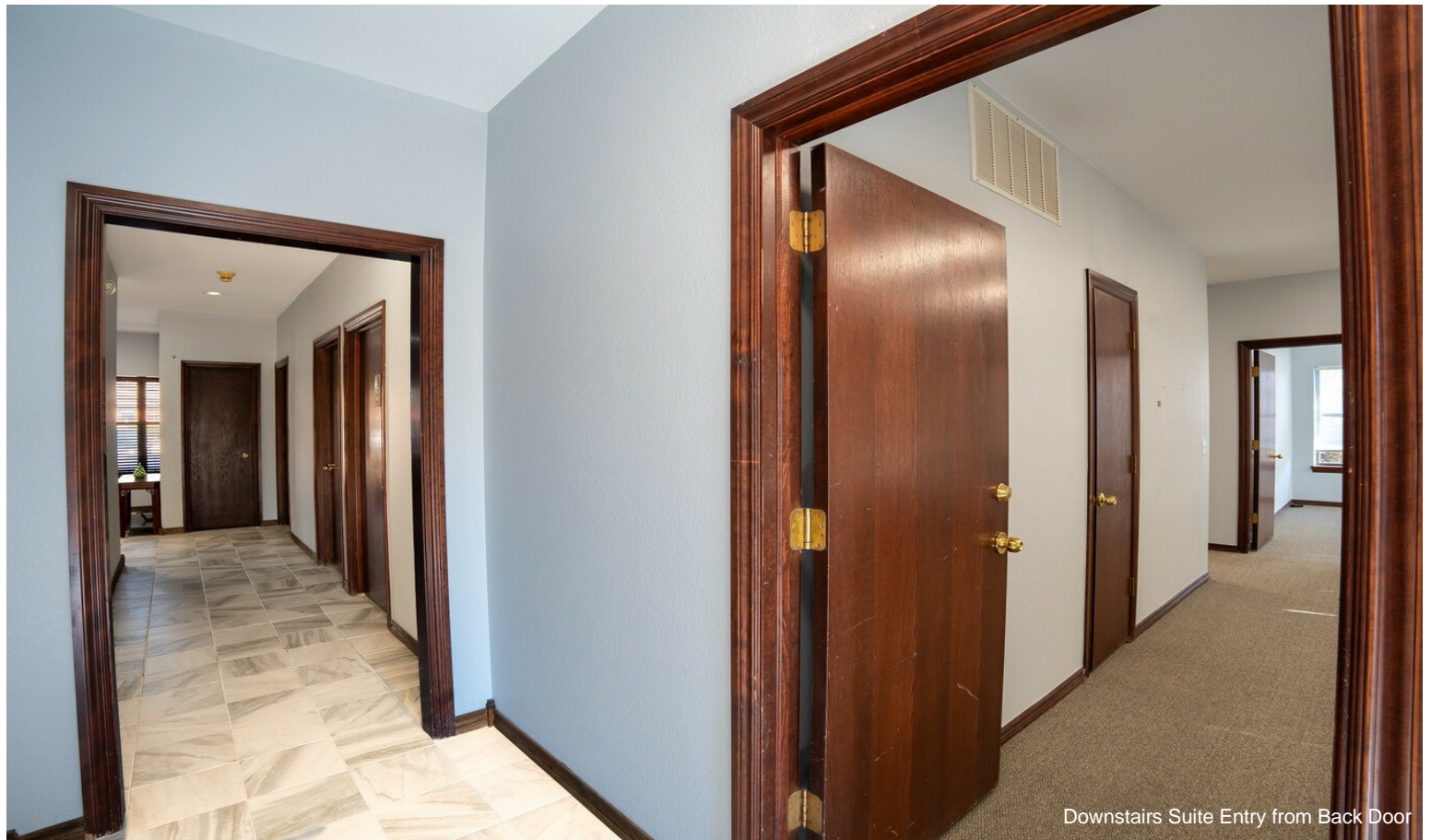
Downstairs Suite Entry from Back Door