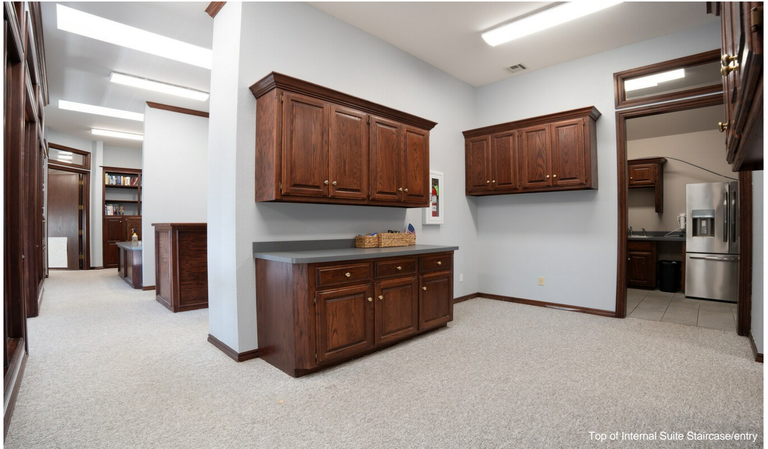
Top of Internal Suite Staircase/entry