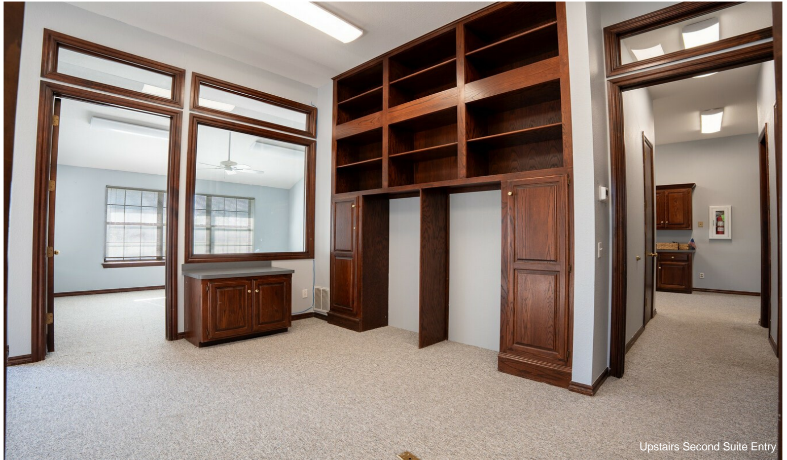
Upstairs Second Suite Entry