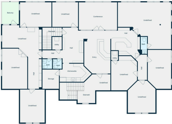
Floor Plan Created By Cubicase App. Measurements Deemed Highly Reliable But Not Guaranteed.