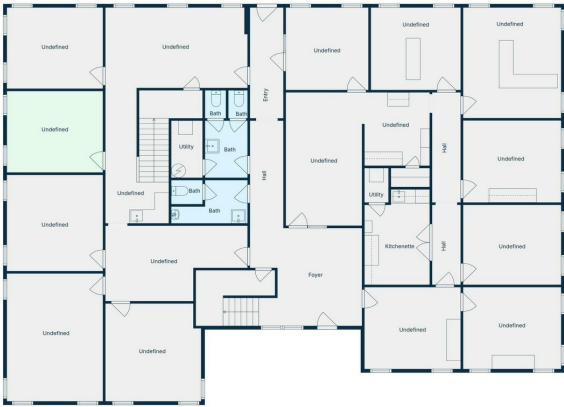
Floor Plan Created By Cubicase App. Measurements Deemed Highly Reliable But Not Guaranteed.