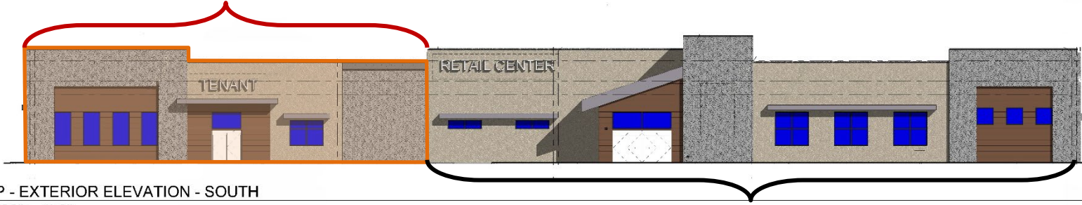
1 DP - EXTERIOR ELEVATION - SOUTH 3/32" = 1'-0"