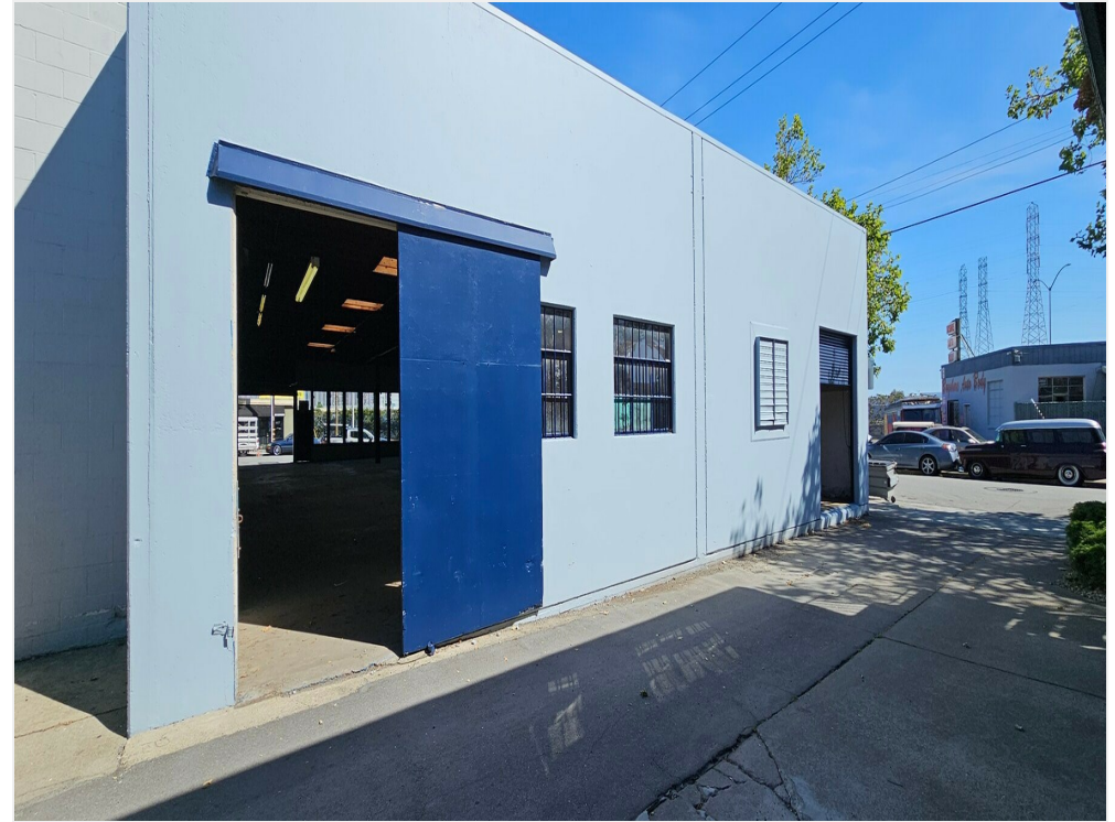
View from rear alley