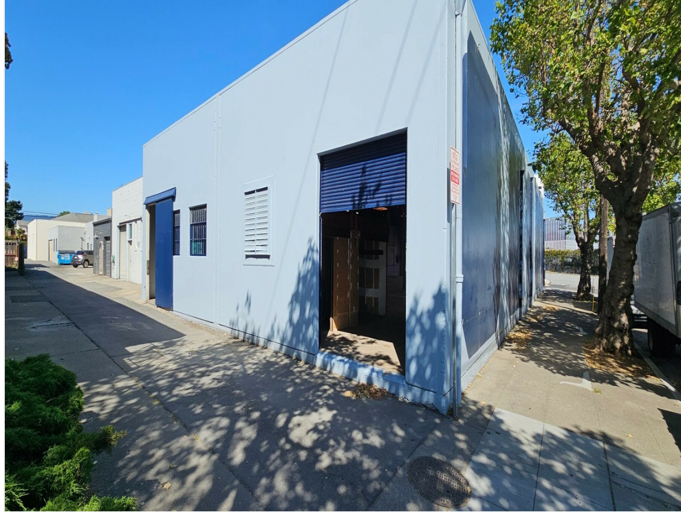
View from rear alley