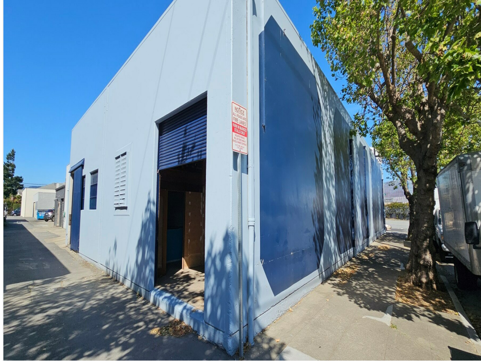
View from rear alley