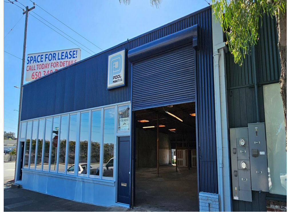
View from street