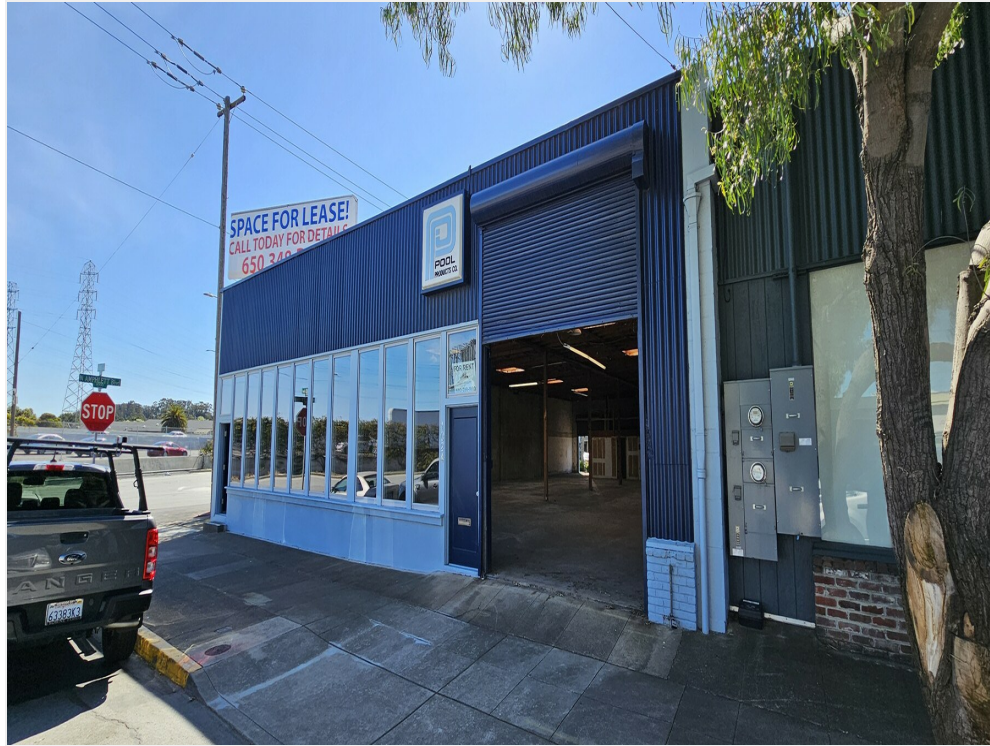
View from street