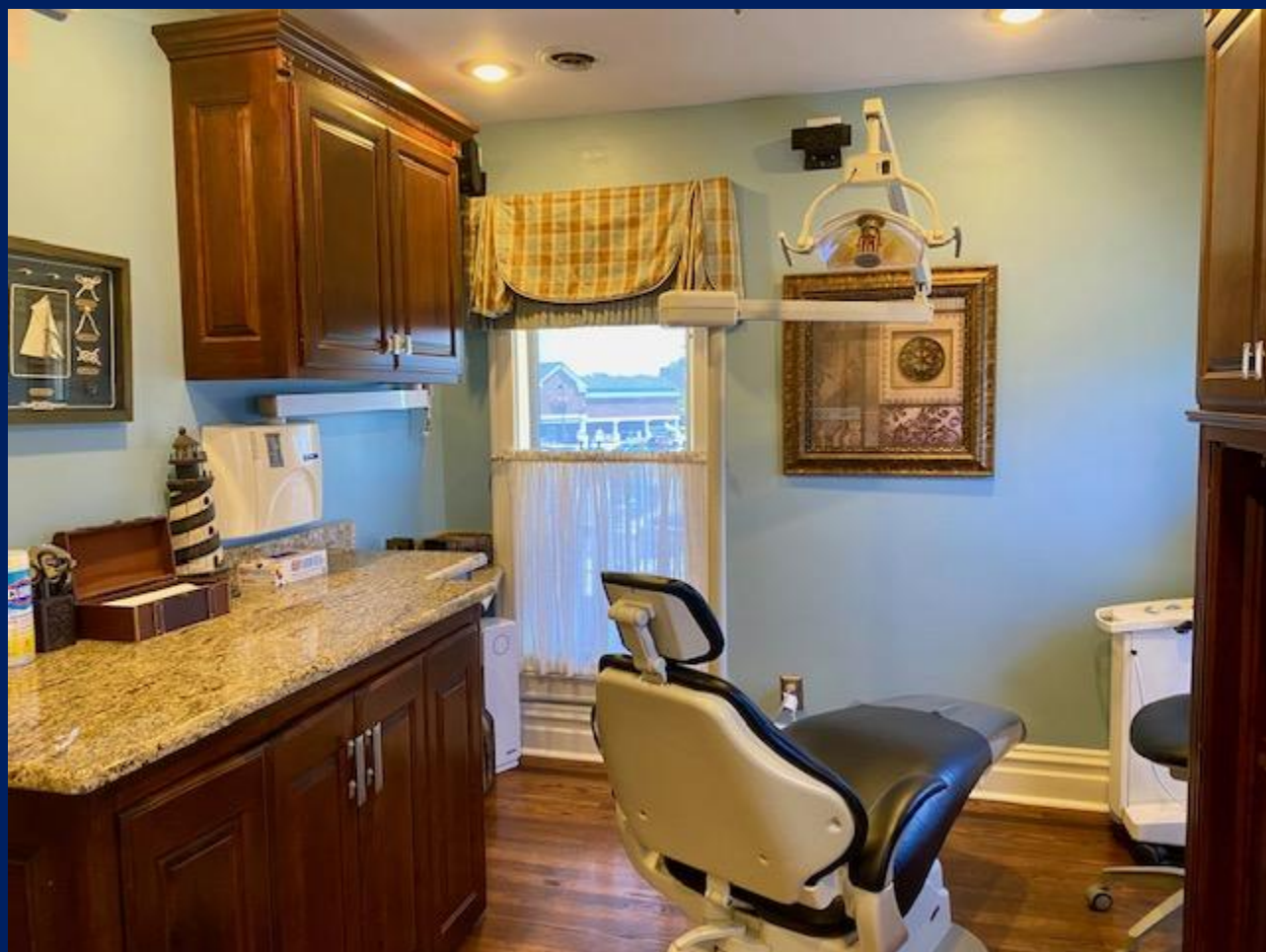
2 nd Floor Operatory