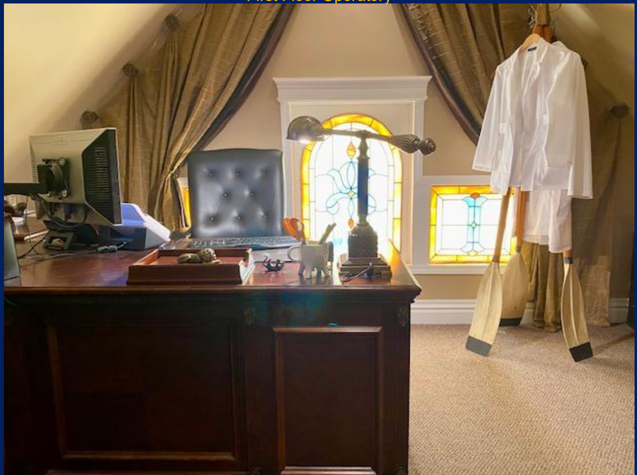
Third Floor Private Office