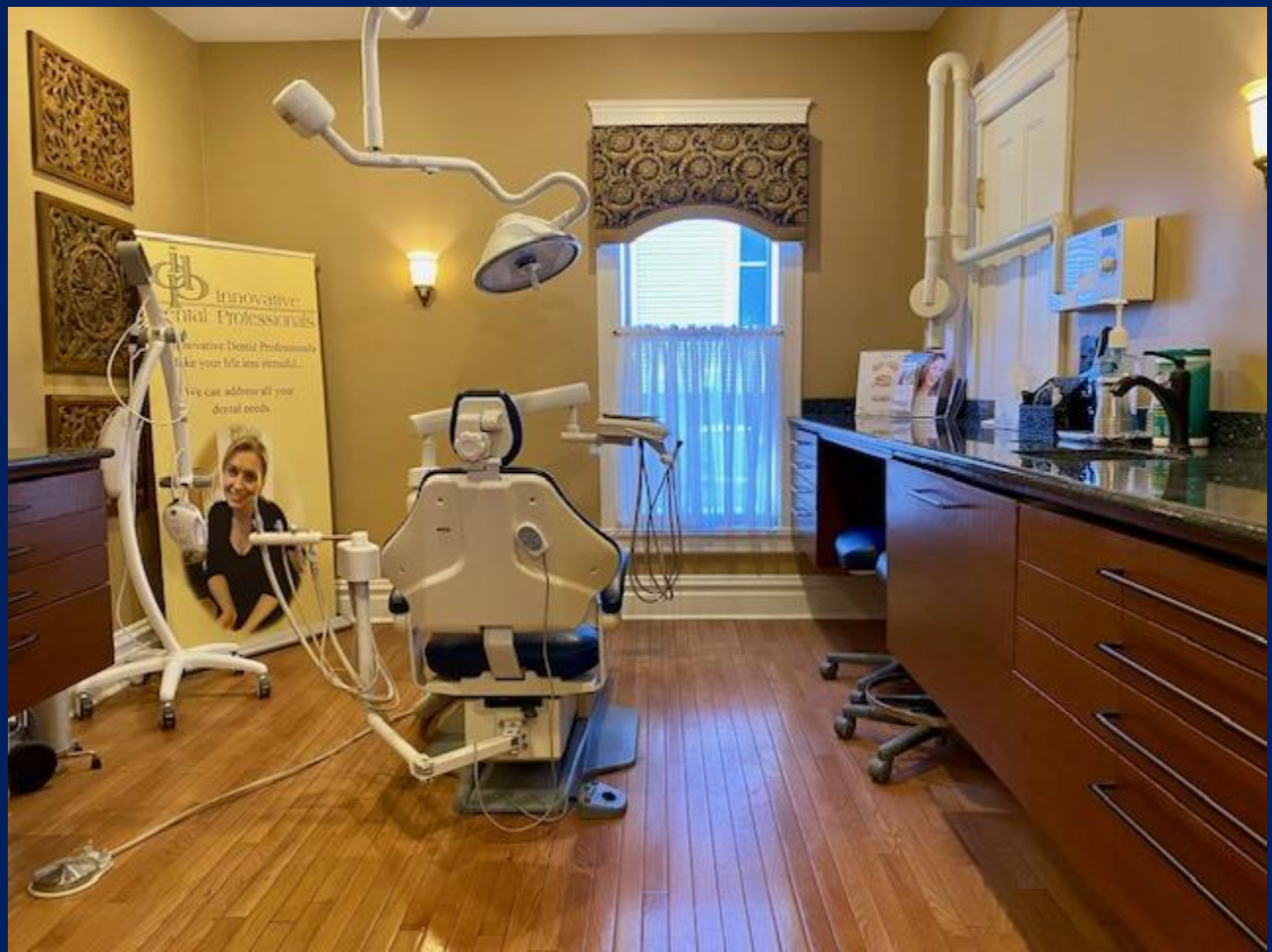
First Floor Operator