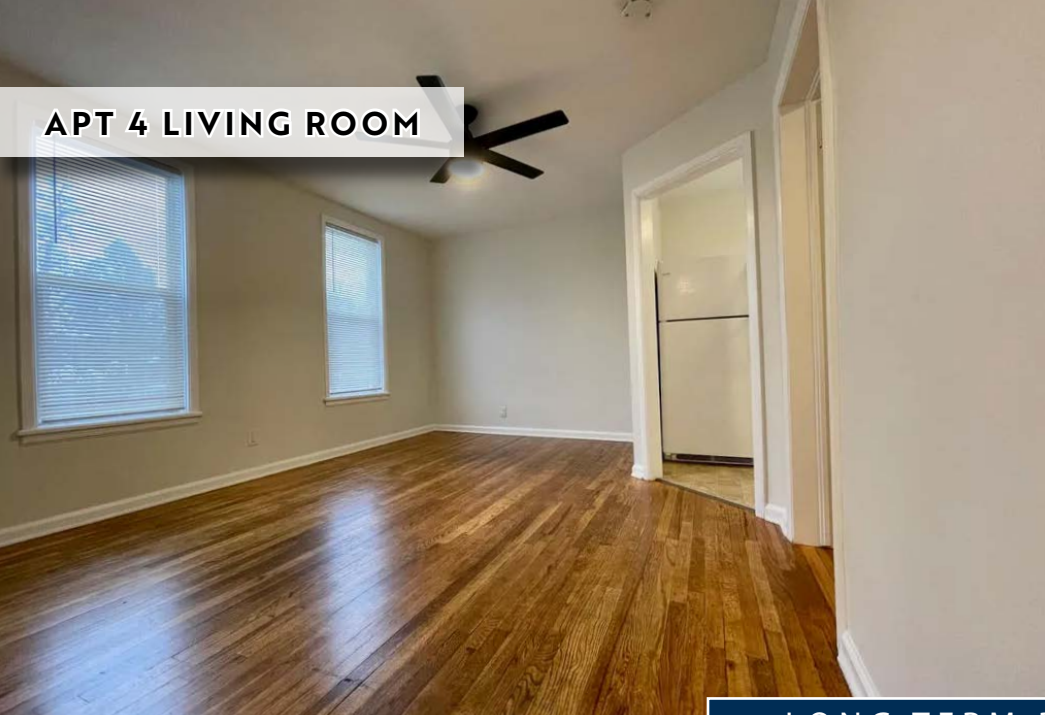
APT 4 LIVING ROOM