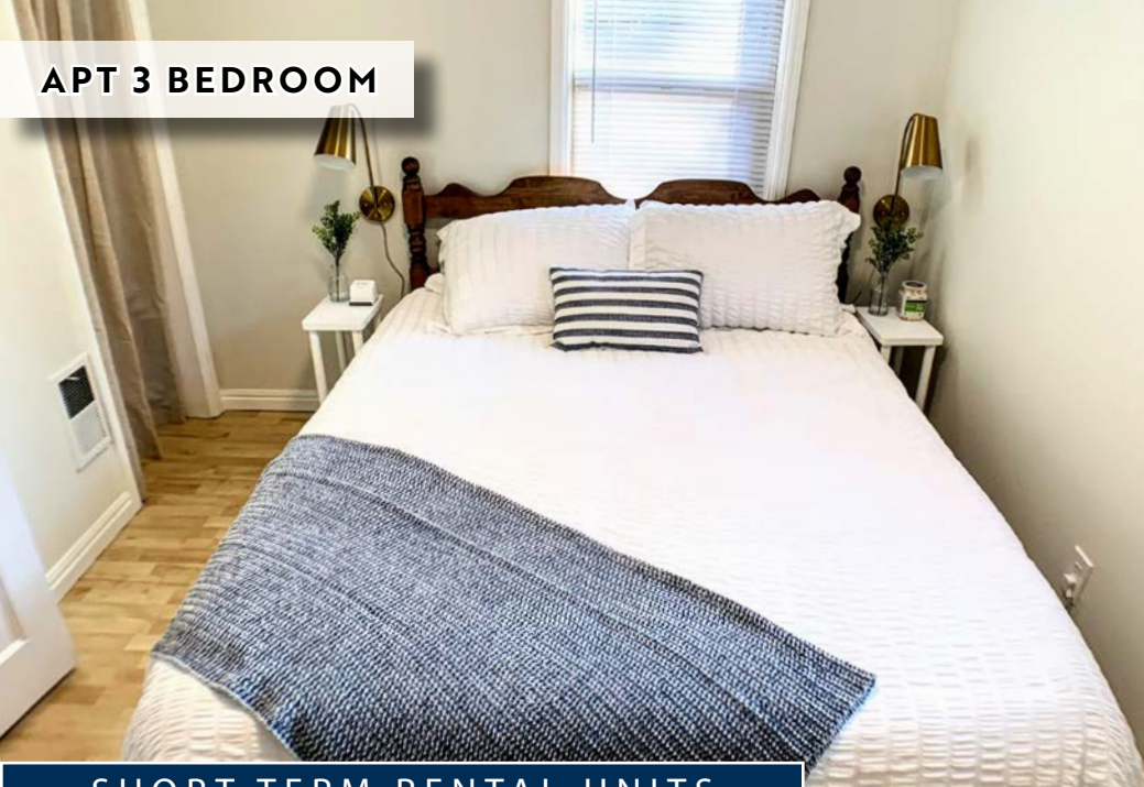
SHORT TERM RENTAL UNITS