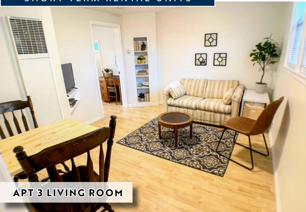
APT 3 LIVING ROOM