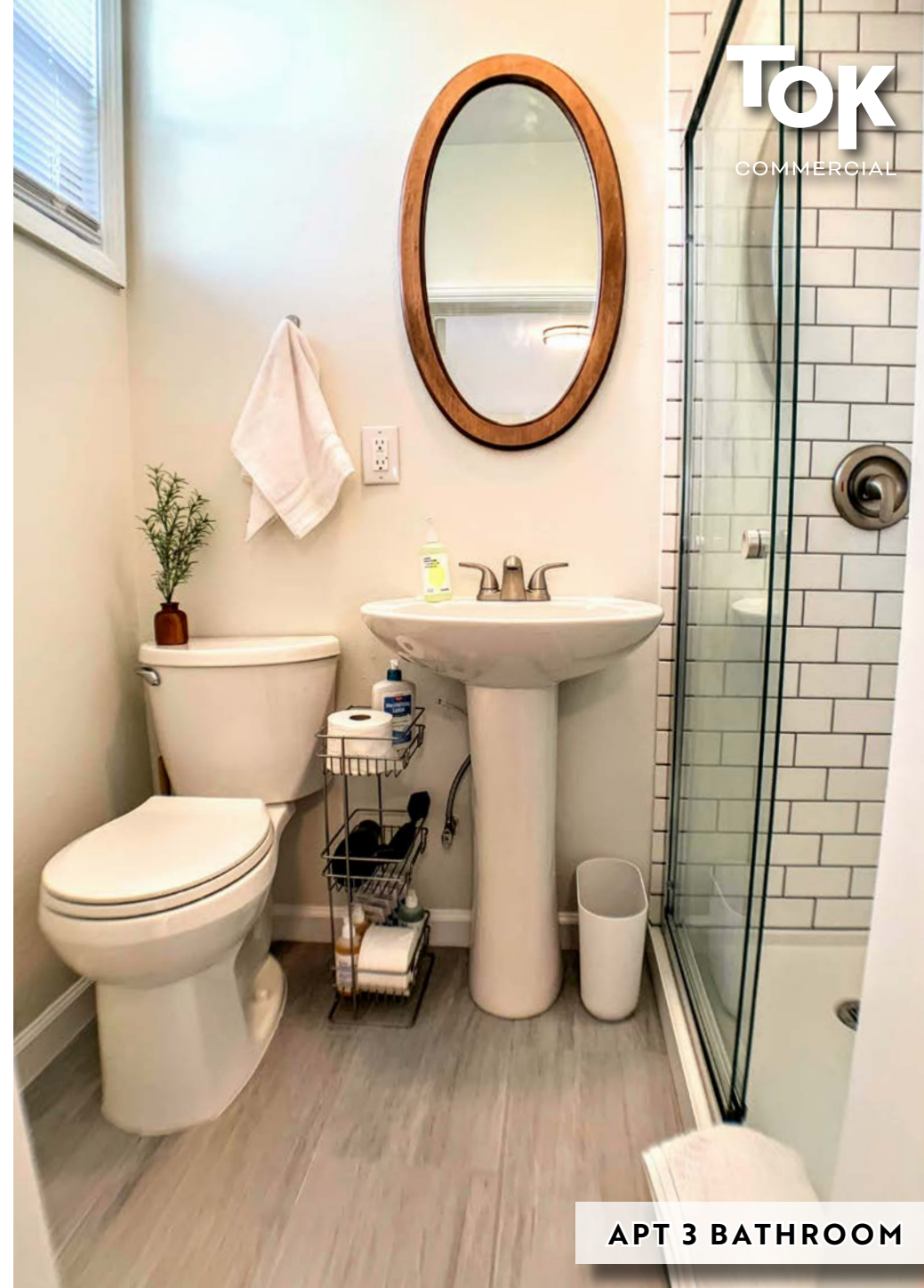
APT 3 BATHROOM