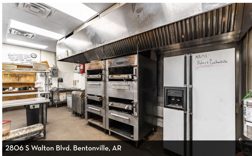
2806 S Walton Blvd. Bentonville, AR