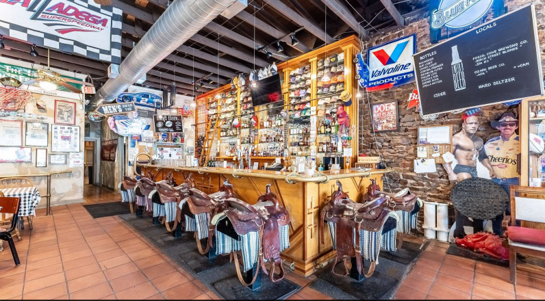
316 W Dickson St. Fayetteville, AR