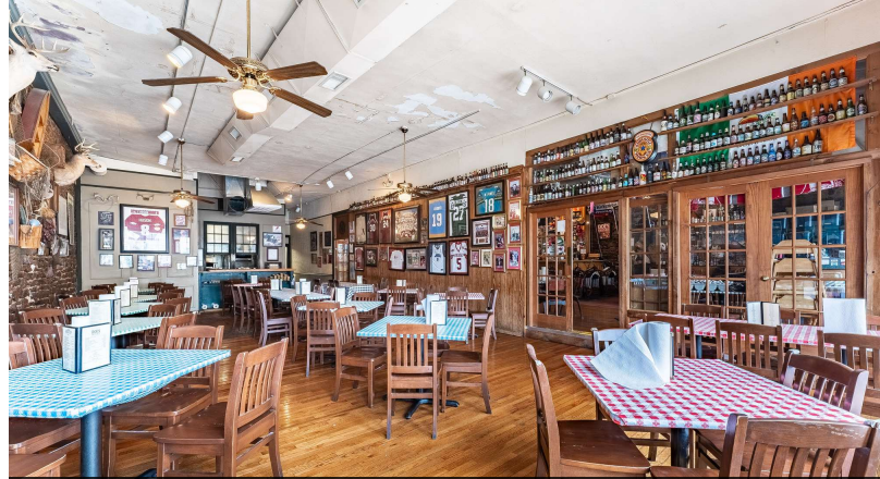
316 W Dickson St. Fayetteville, AR