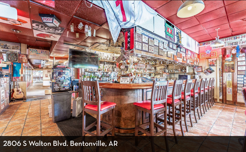
2806 S Walton Blvd. Bentonville, AR