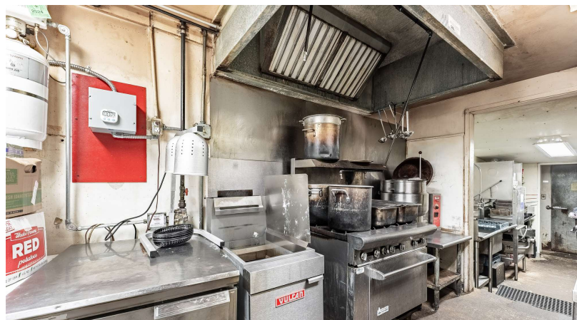
316 W Dickson St. Fayetteville, AR