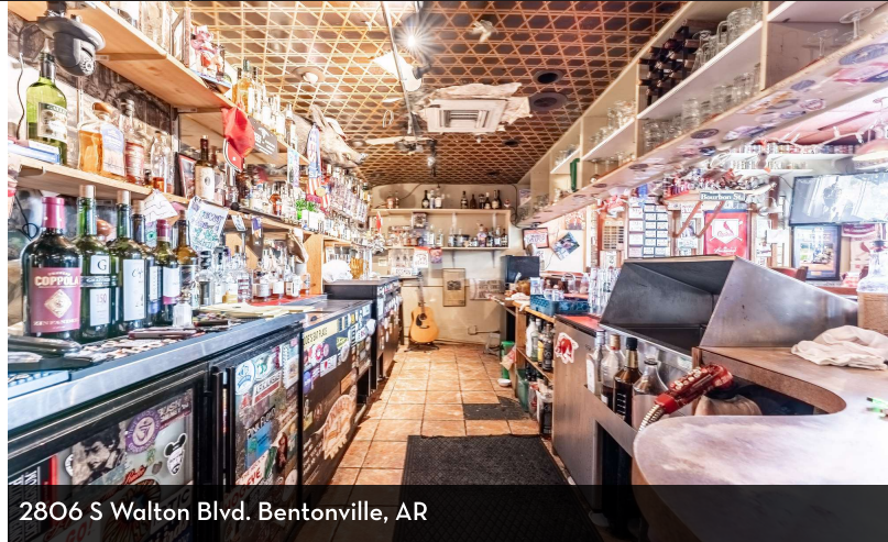
2806 S Walton Blvd. Bentonville, AR