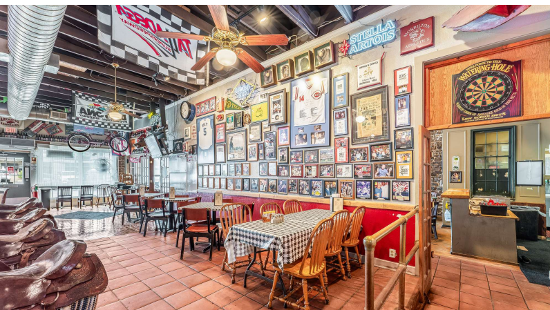
316 W Dickson St. Fayetteville, AR