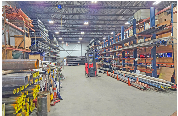
High bay warehouse