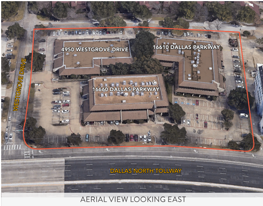
AERIAL VIEW LOOKING EAST

16610, 16660 DALLAS PARKWAY & 4950 WESTGROVE DRIVE | DALLAS, TX 75248