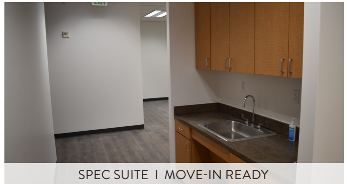
SPEC SUITE | MOVE-IN READY