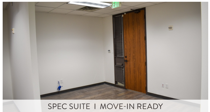
SPEC SUITE | MOVE-IN READY

14643 DALLAS PARKWAY, SUITE 950, LB#58 | DALLAS, TX 75254 214.294.4400 | YOUNGERPARTNERS.COM