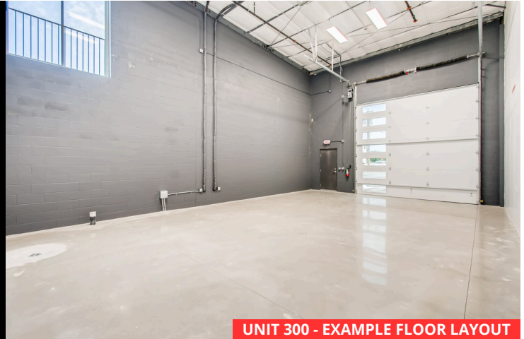
UNIT 300 - EXAMPLE FLOOR LAYOUT

Taxes: $7,224 Annually (subject to increase)