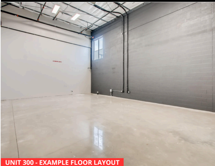
UNIT 300 - EXAMPLE FLOOR LAYOUT