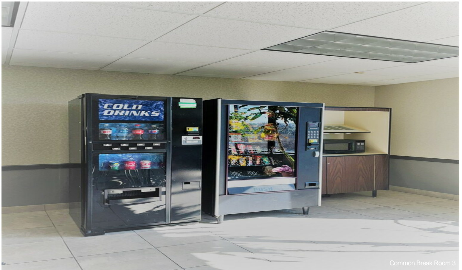
Common Break Room 3