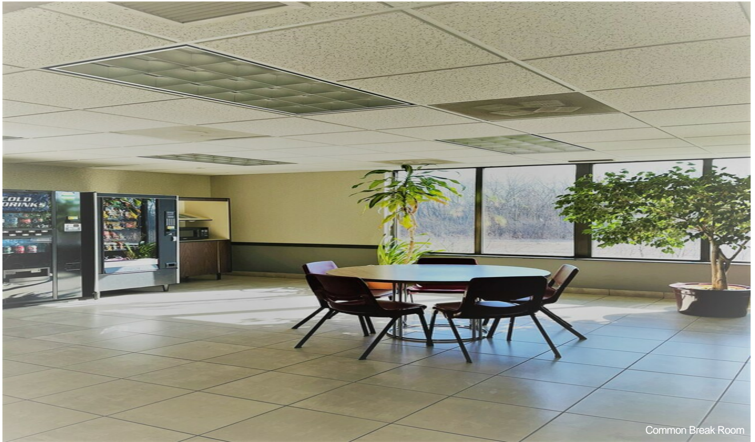
Common Break Room