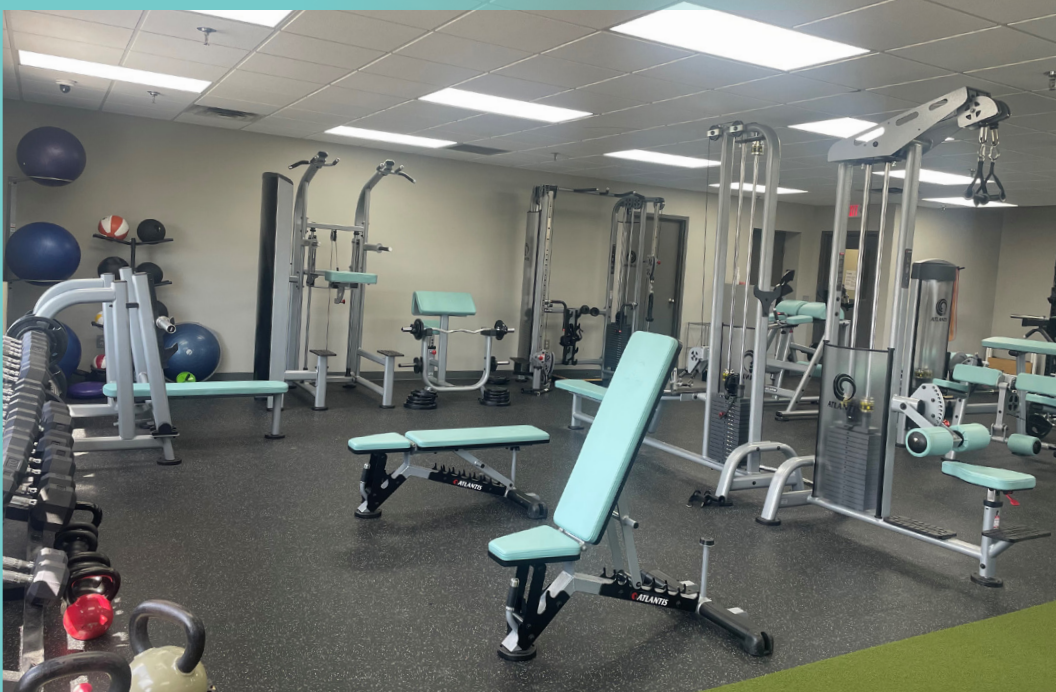
MEZZANINE SECOND FLOOR