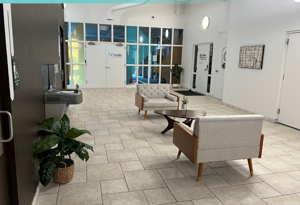
COMMON AREA HALLWAY