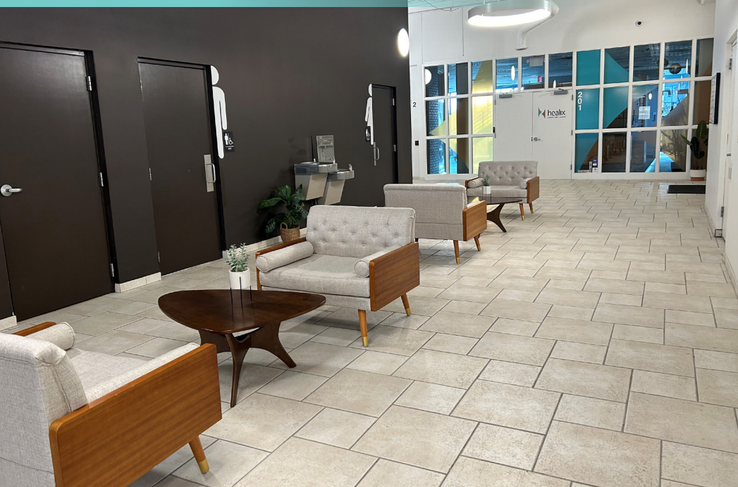
ENTRANCE TO MEZZANINE SUITE