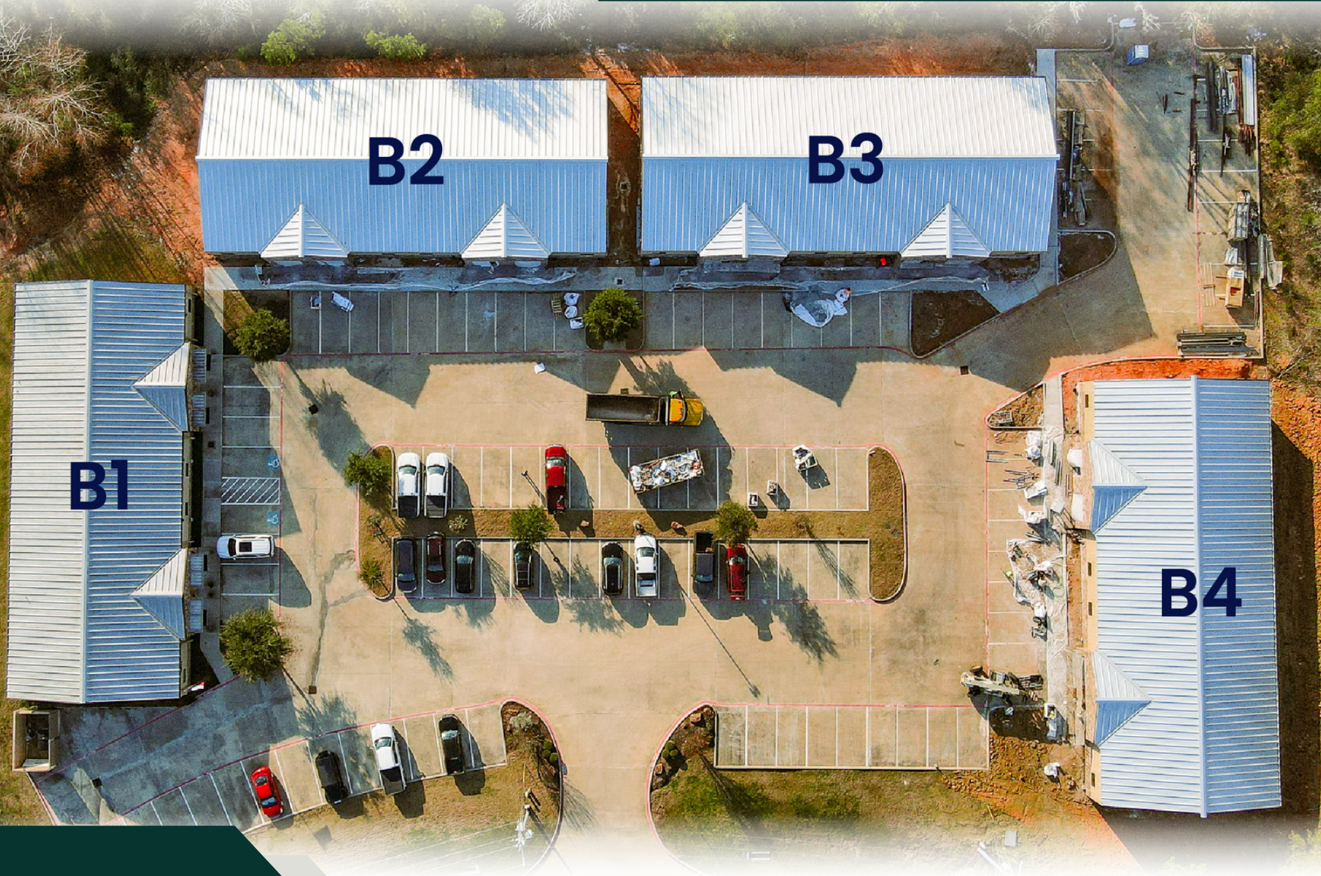
Site Plan B