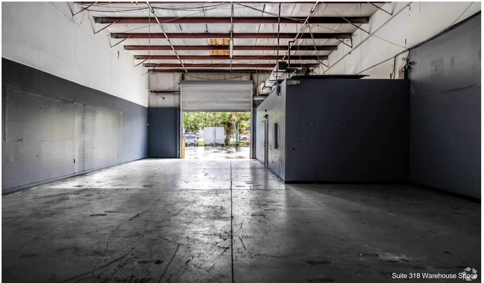
Suite 318 Warehouse Space