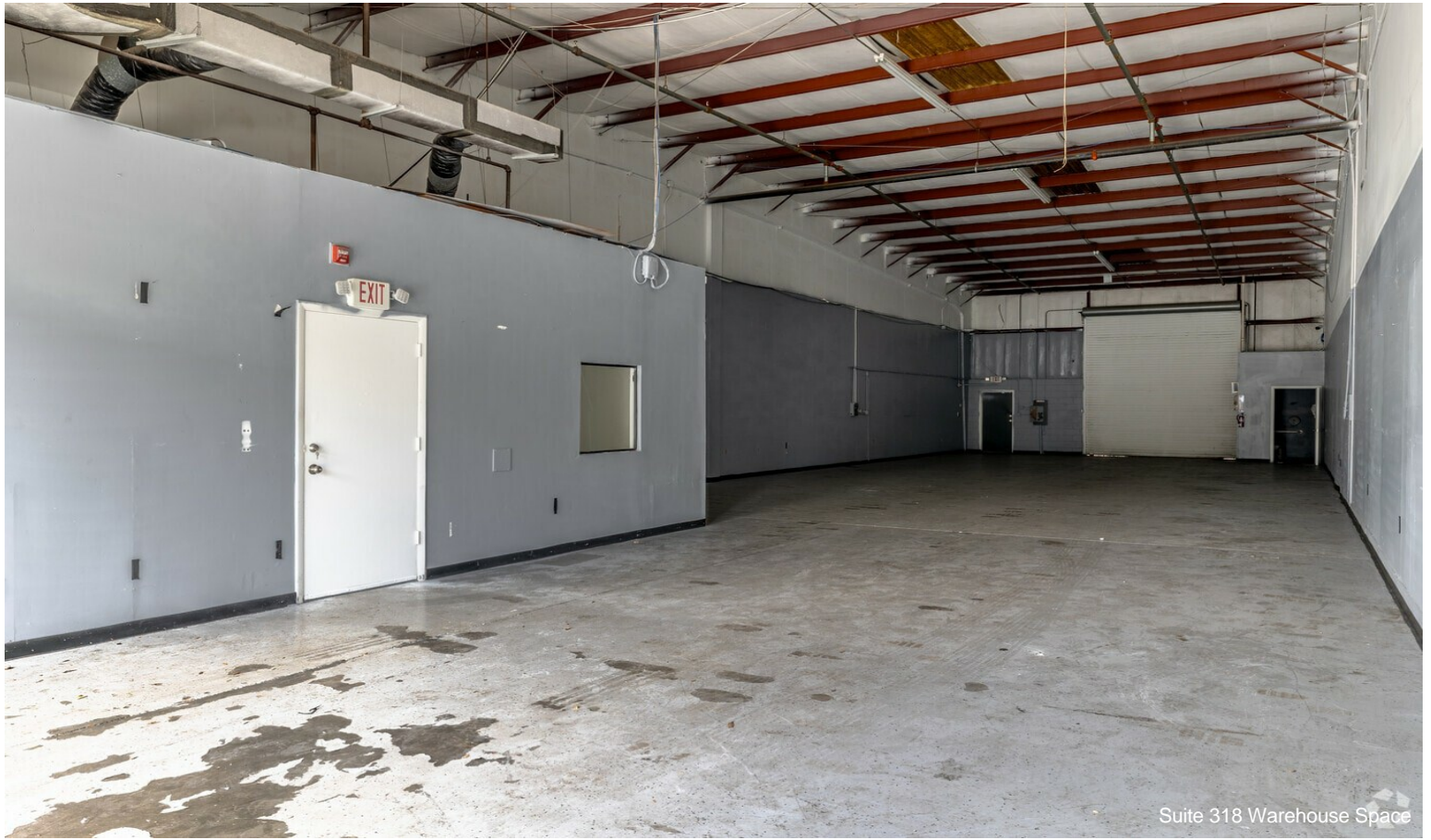
Suite 318 Warehouse Space