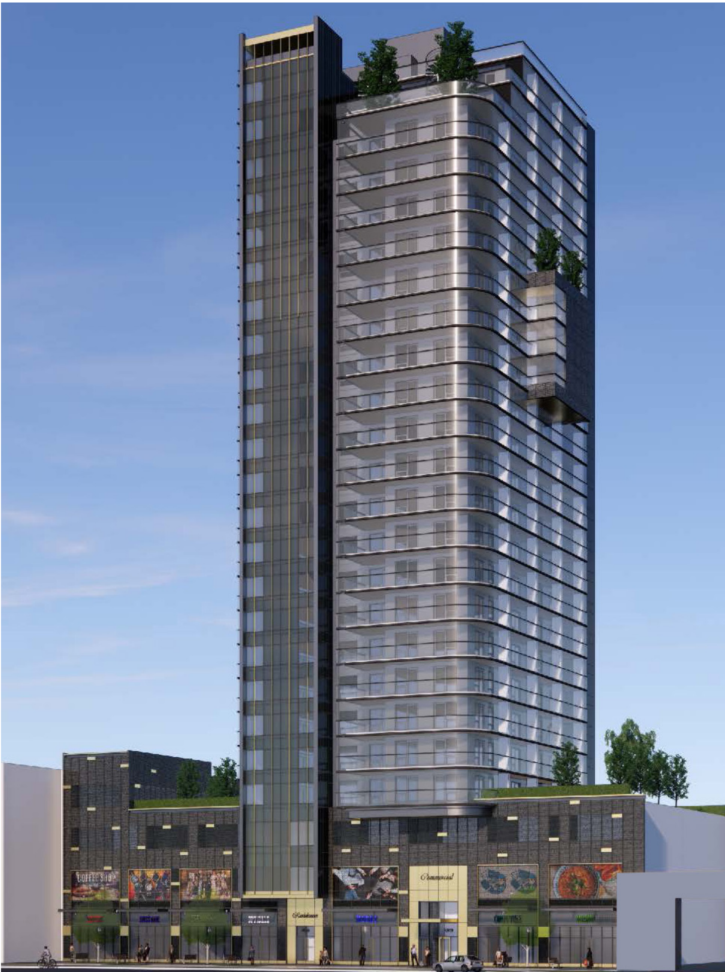
RENDERING FROM APPLICATION WITH INITIAL REVIEW