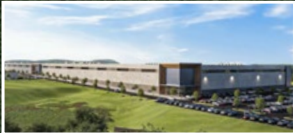
HARRISBURG NORTH TRADE CENTER