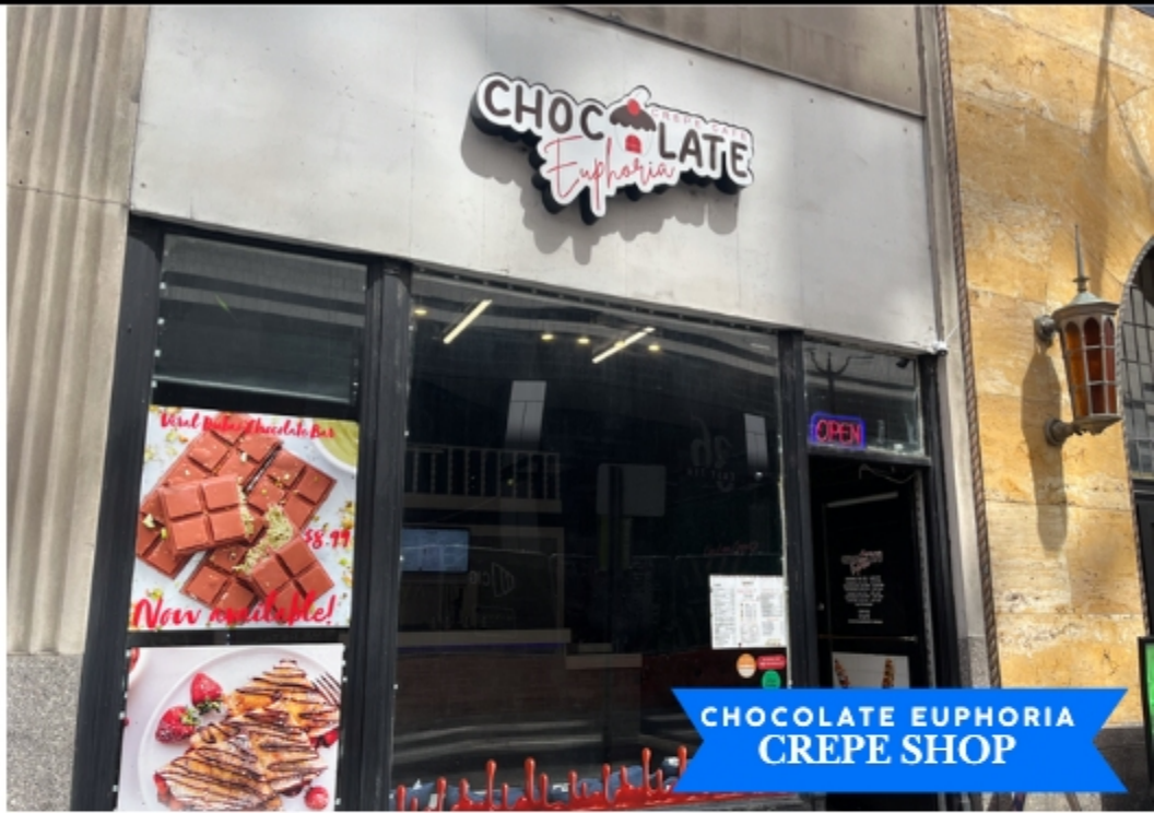
CHOCOLATE EUPHORIA CREPE SHOP