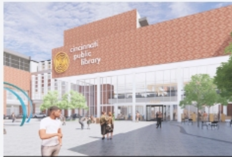
Public Library Renovation Major Renovation of Public Library