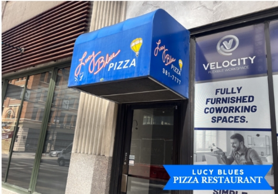
LUCY BLUES PIZZA RESTAURANT