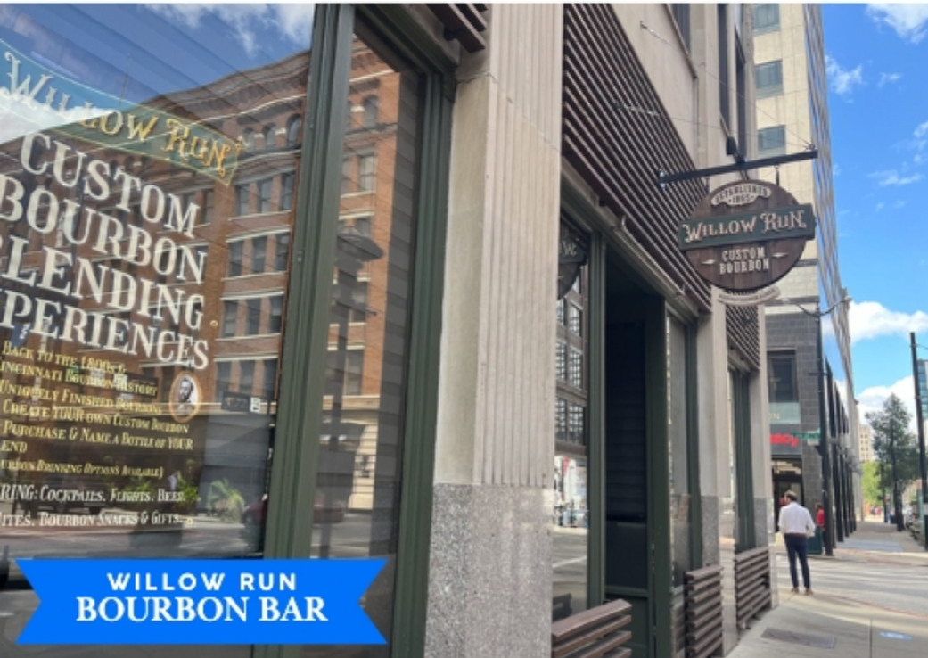
WILLOW RUN BOURBON BAR