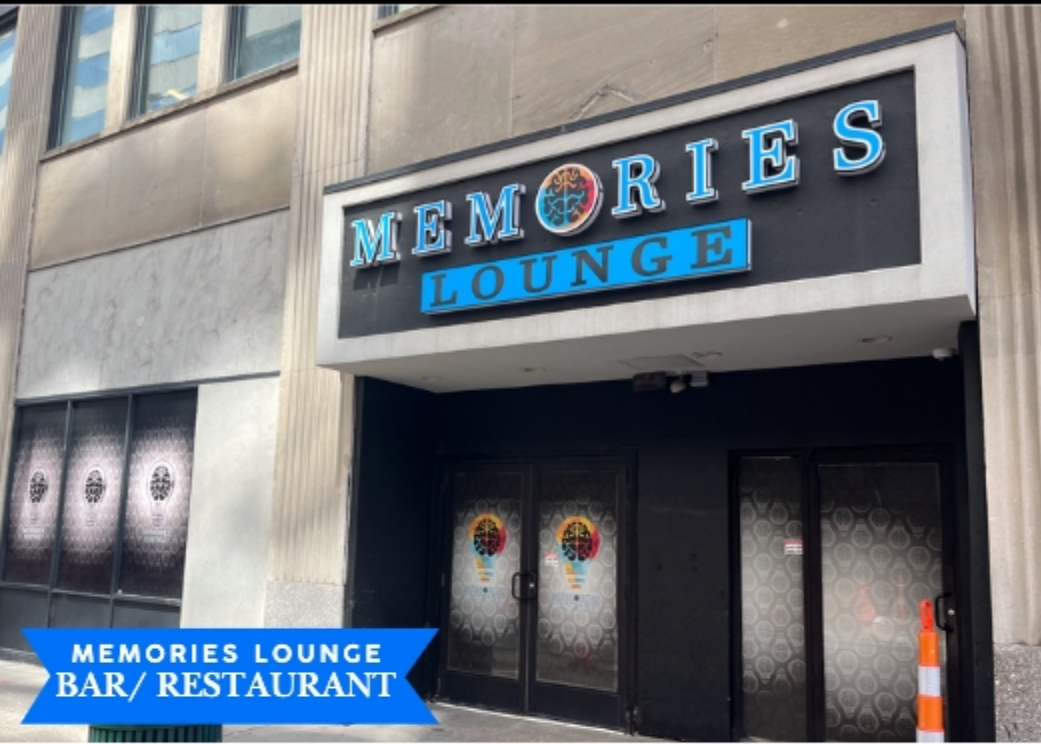
MEMORIES LOUNGE BAR/ RESTAURANT