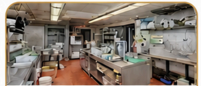
Fully Equipped Commercial Kitchen