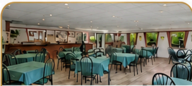
Existing Restaurant Dining Area