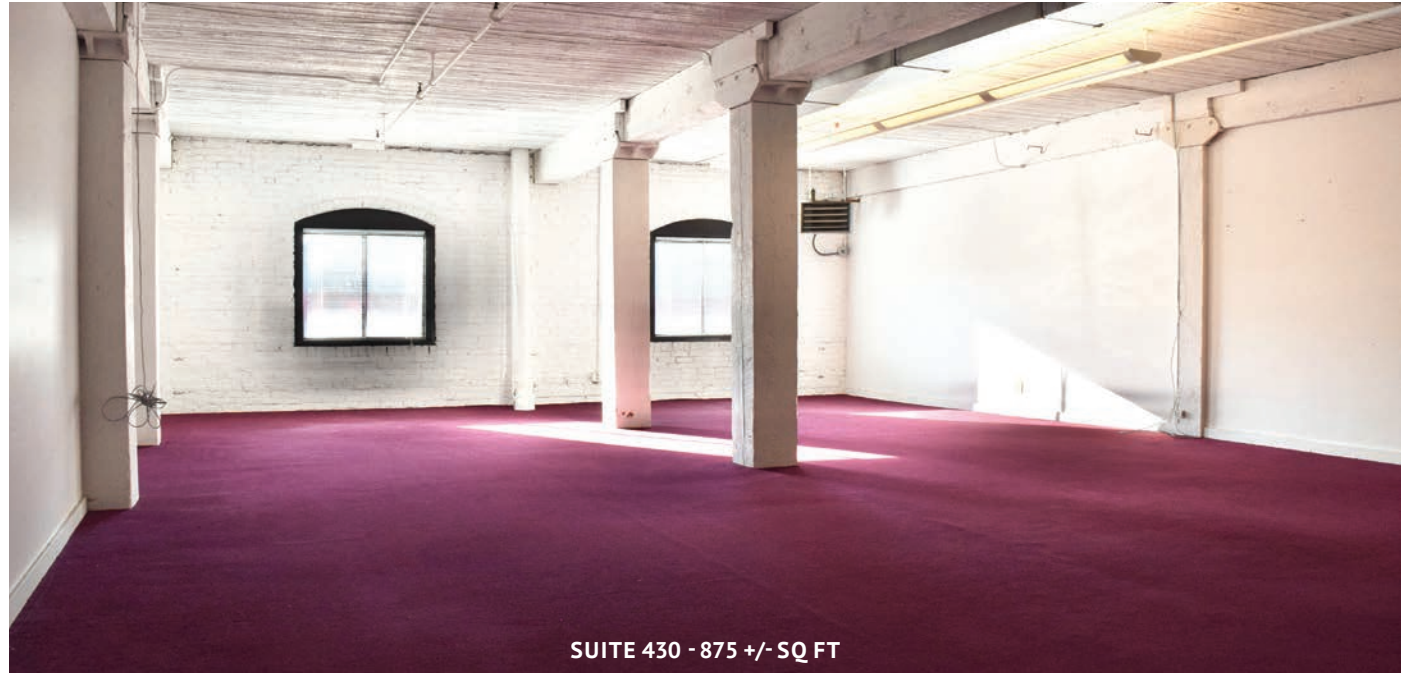
SUITE 430 - 875 +/- SQ FT

I-5 Access and 405 Access Near Tri-Met Bus line and MAX Light Rail Walk to restaurants, shopping, parks, medical and residential in NW Portland.