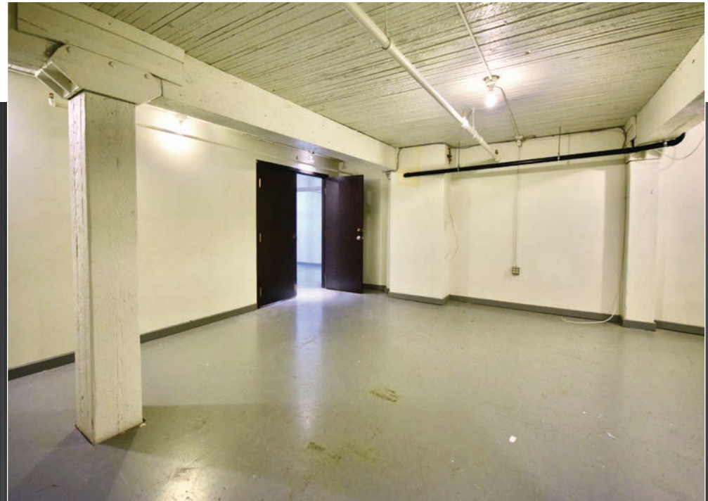
STORAGE UNIT - 450 +/- SQ FT