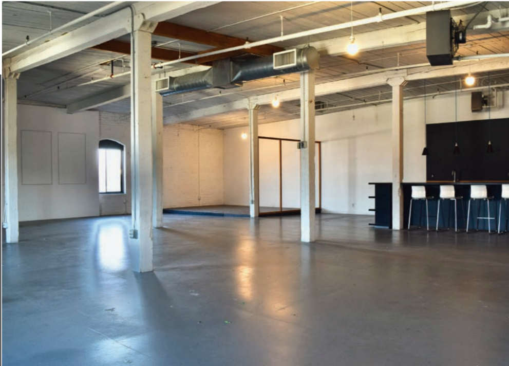
SUITE 700 - 3,000 +/- SQ FT