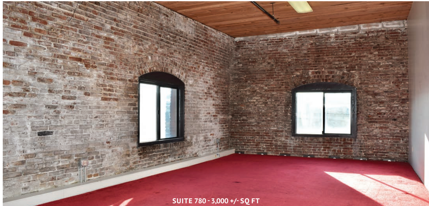
SUITE 780 - 3,000 +/- SQ FT

This information has been secured from sources we believe to be reliable, but we make no representations or warranties, expressed or implied, as to the accuracy of the information. References to square footage or age are approximate. User must verify the information and bears all risk for any inaccuracies.