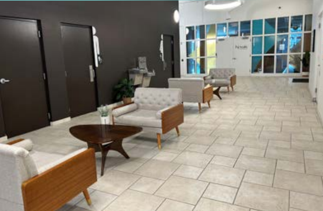
ENTRANCE TO MEZZANINE SUITE