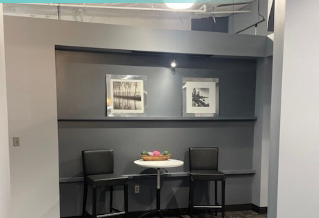
MODERN, EXPOSED CEILINGS