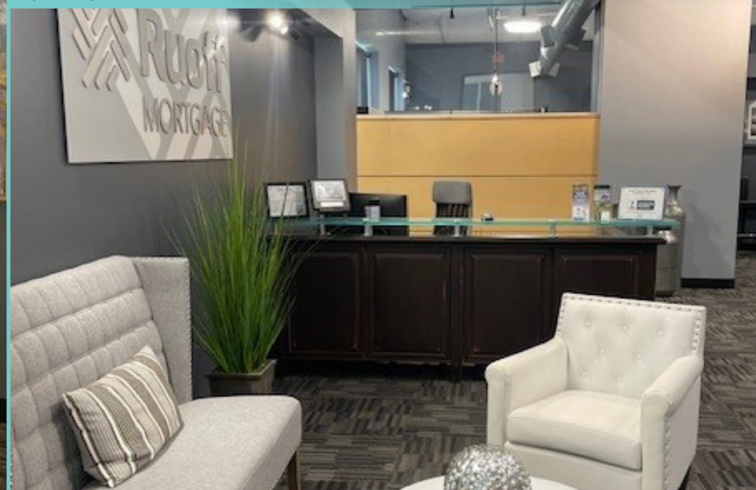
2,225 SQUARE FEET