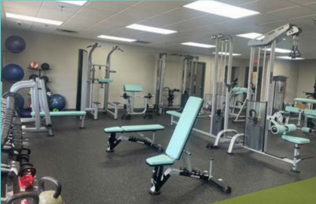
MEZZANINE SECOND FLOOR