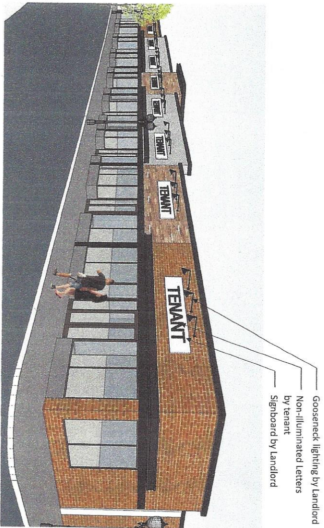
View of proposed front elevation with lighting – n.t.s.

Commercial Investment Real Estate Retail Leasing and Sales Specialist