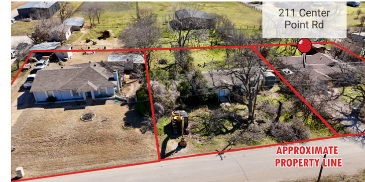
Close-up aerial highlighting the subject property boundaries.

Strong Market Growth – Weatherford continues rapid commercial and residential growth, enhancing long-term land value and demand in this part of Parker County.