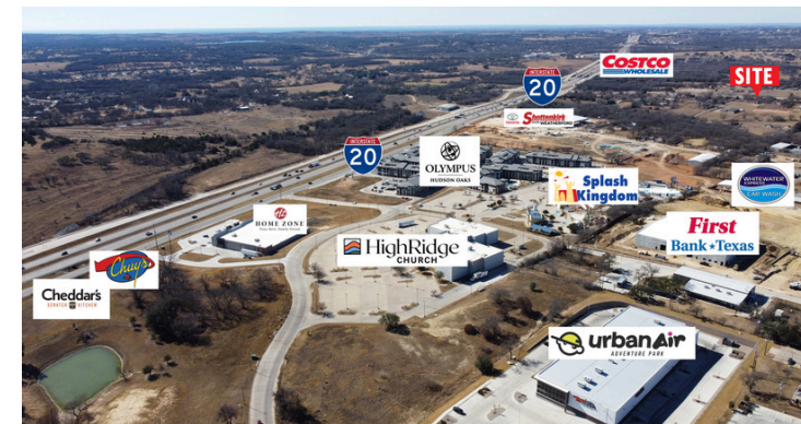
Aerial overview illustrating the subject property in relation to surrounding commercial and residential developments.