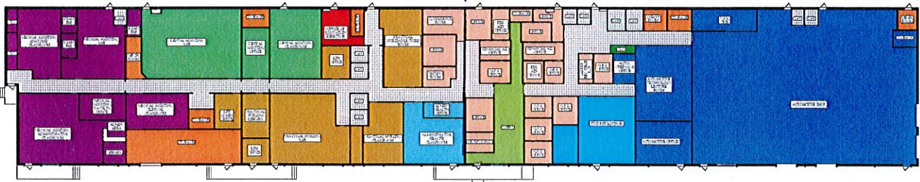
WATERTOWN CAMPUS BUILDING "A" PLAN