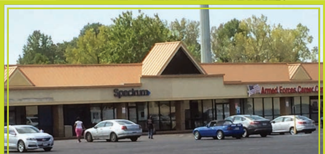
Strip Center Space 1,300 SF to 8,000 SF