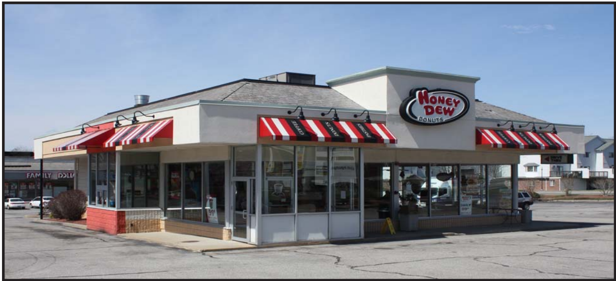
NEW LONDON SQUARE - 1745 MAIN ST. - WEST WARWICK, RI