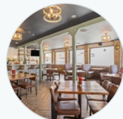
A Beloved Destination

Anchors the main level beside two spacious dining areas.