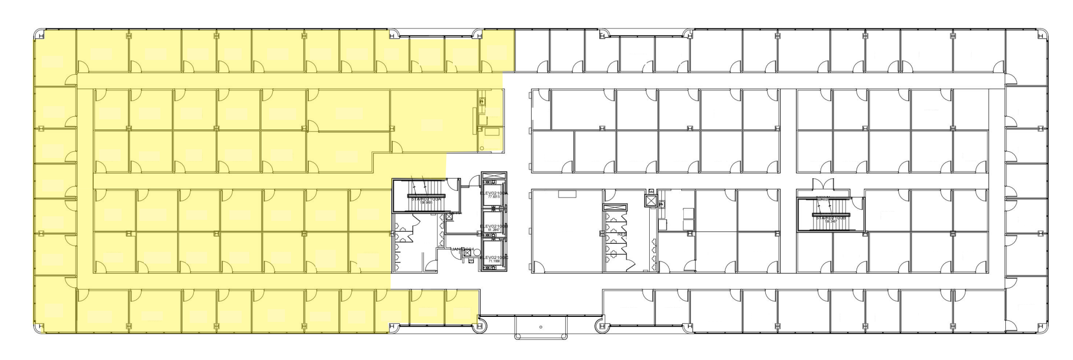
Second Floor - Up to 13,969 RSF