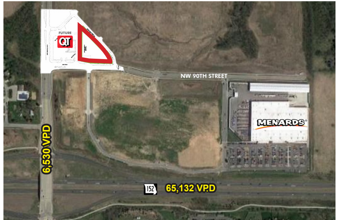
Traffic Count