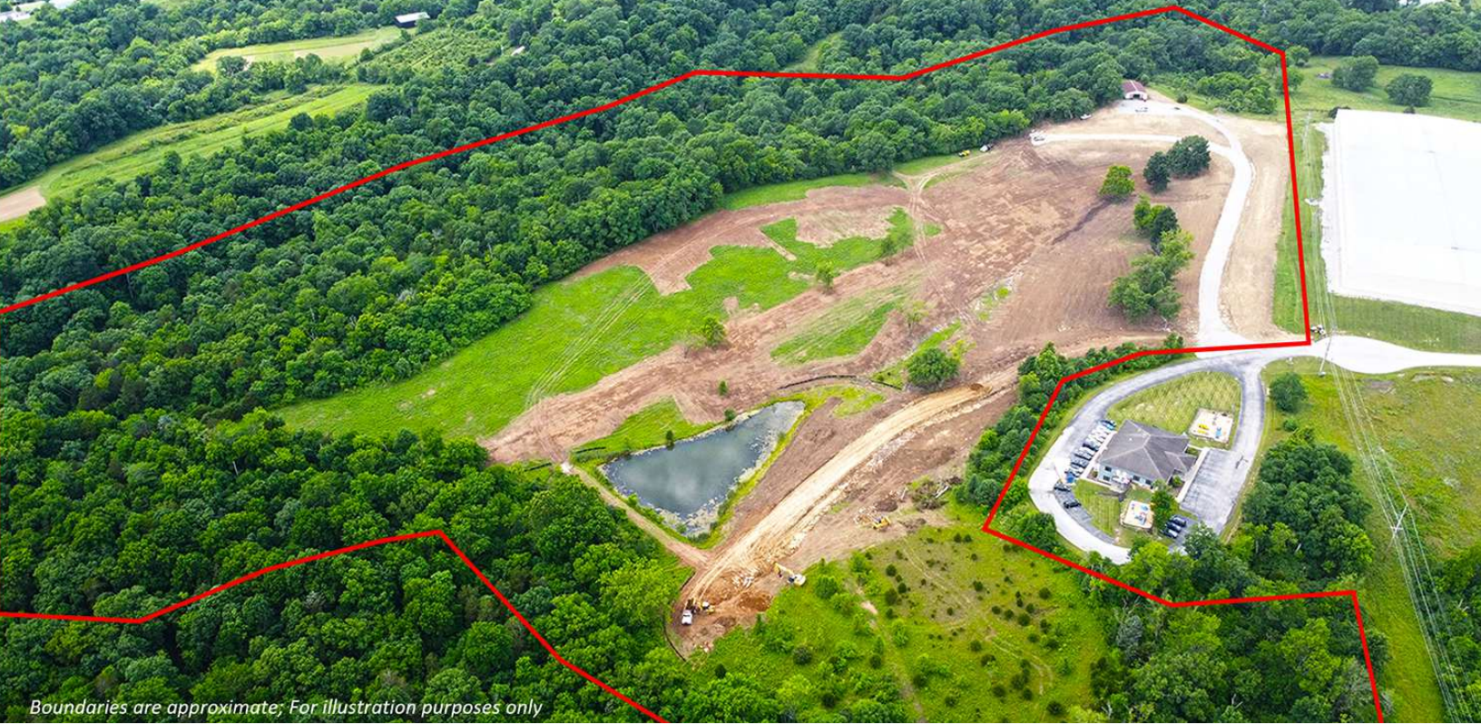
Boundaries are approximate; For illustration purposes only