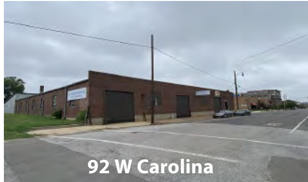
92 W Carolina