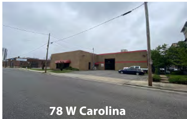
78 W Carolina