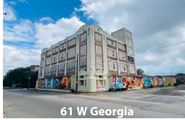
61 W Georgia