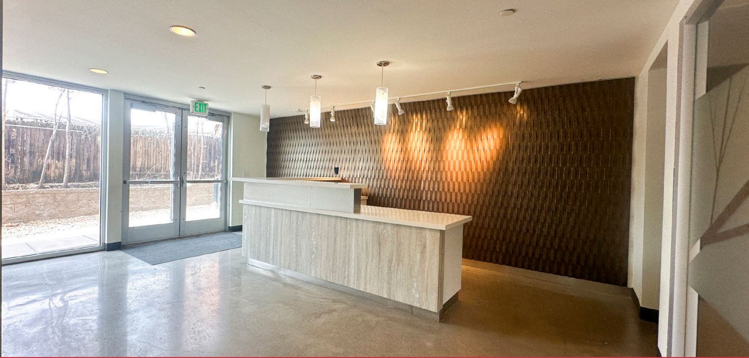
• Reception area with private, off-street entrance