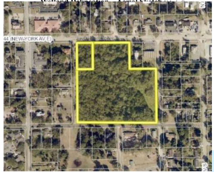
The entire site is uplands