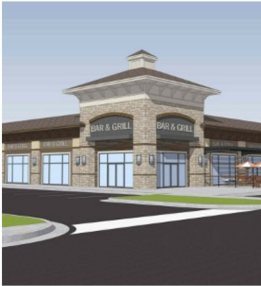
RESTAURANT GARDNER, KS