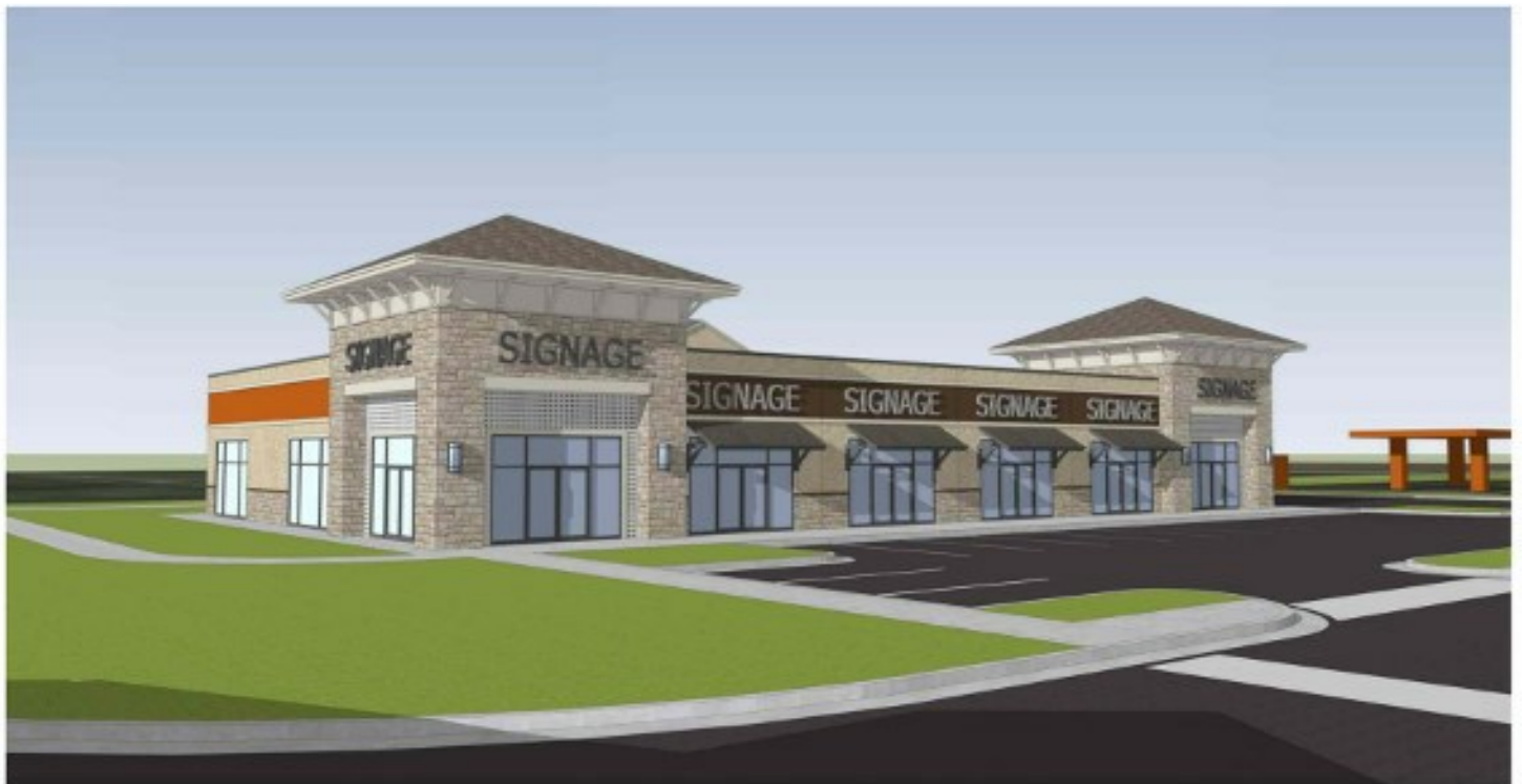
NSPJ WAVERLY PLAZA | RETAIL ALONG W. SANTEFE STREET WAVERLY STREET & W. SANTA FE | GARDNER, KS