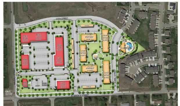
NSPJ WAVERLY PLAZA | SITE PLAN WAVERLY ST. & W. SANTA FE ST. | GARDNER, KS