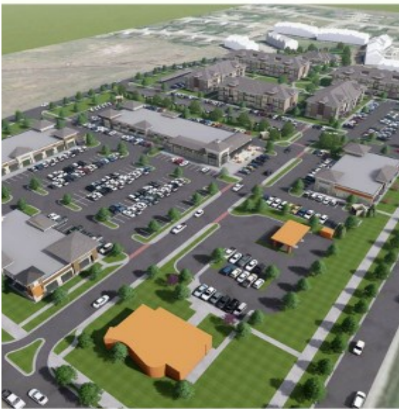
AERIAL FROM SOUTHWEST