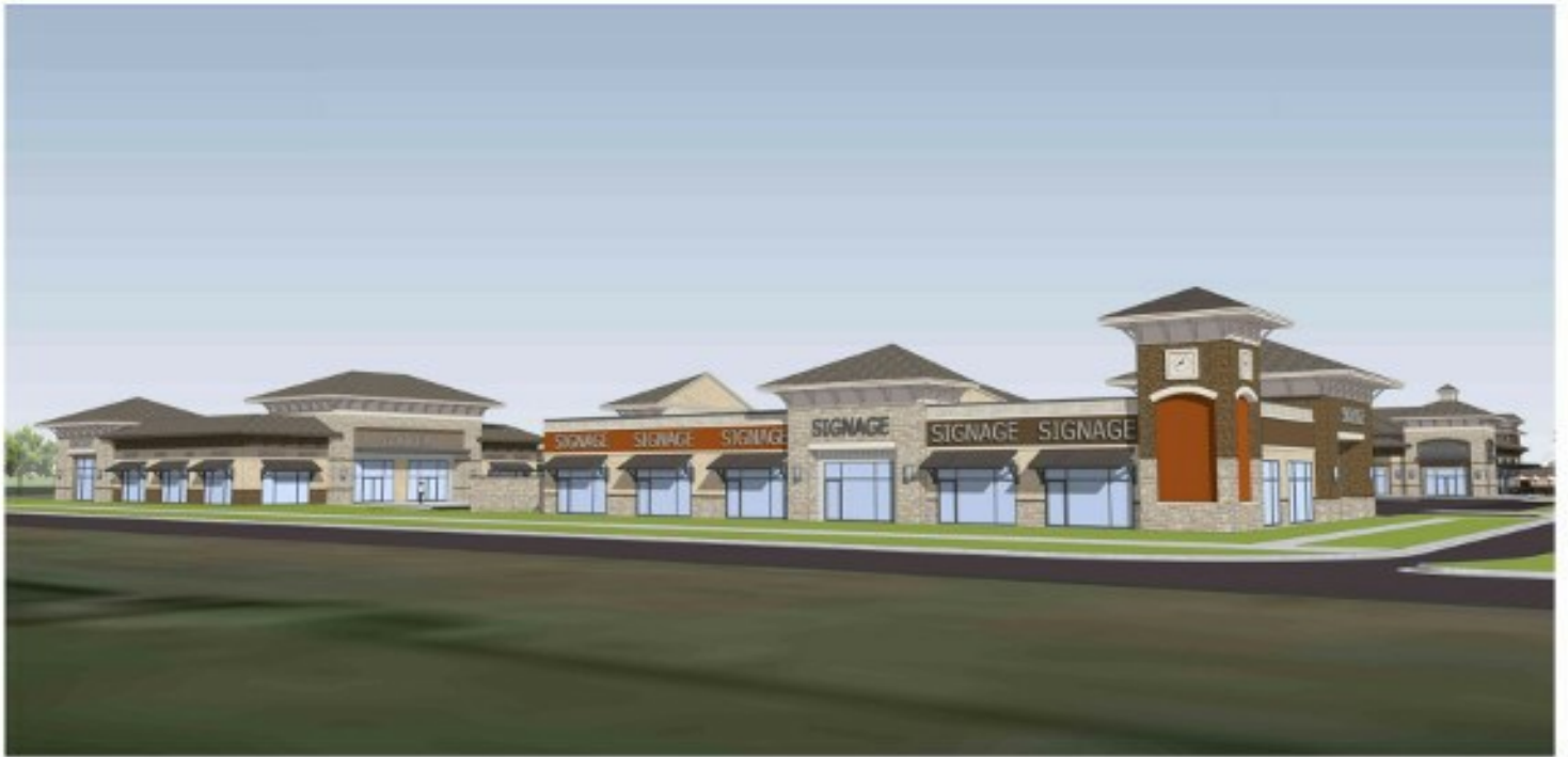
NSPJ WAVERLY PLAZA | VIEW FROM WAVERLY ROAD WAVERLY STREET & W. SANTA FE | GARDNER, KS