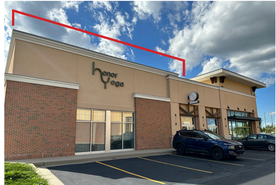
3,208 SF Space