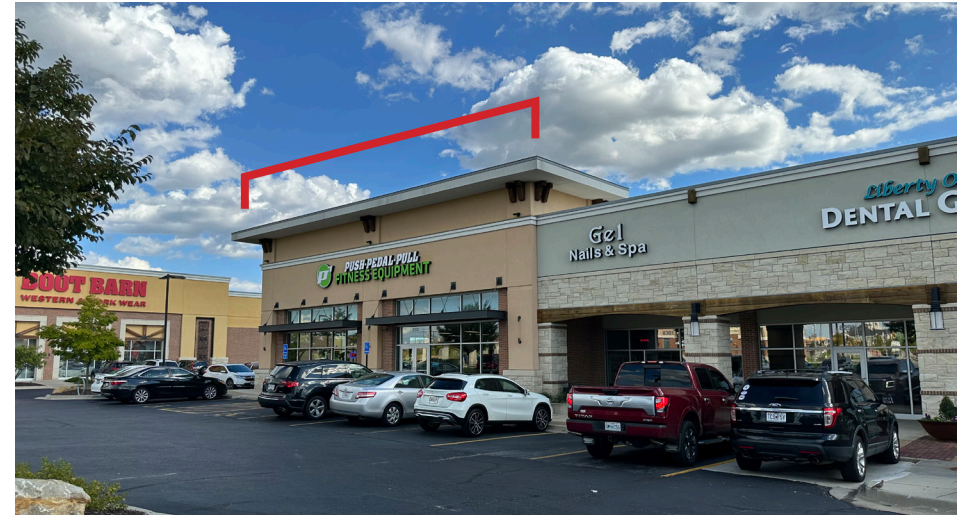
2,792 SF Space