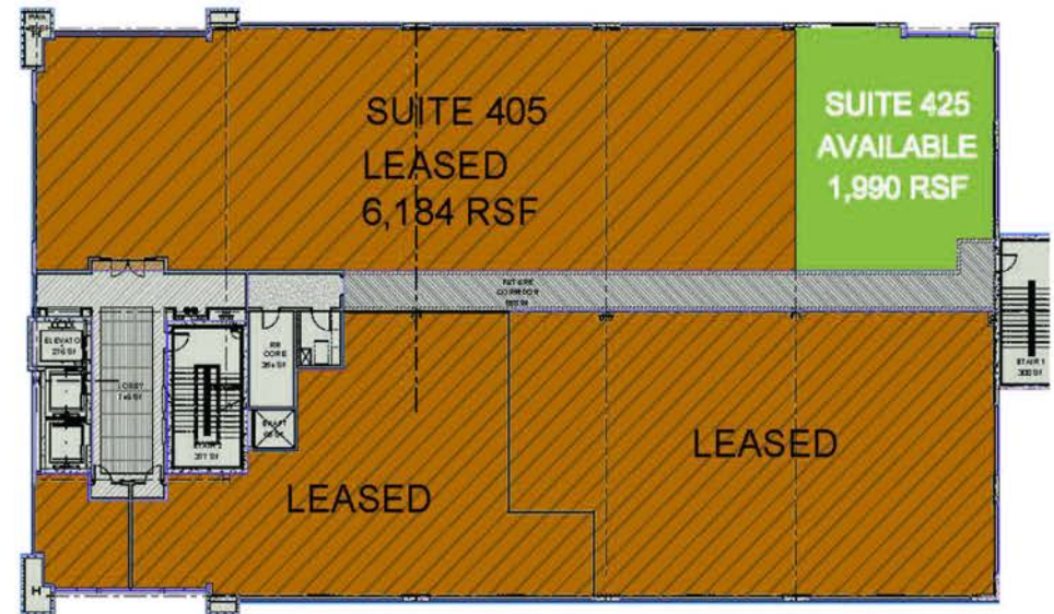
4TH FLOOR RSF's include a 13.4% load factor