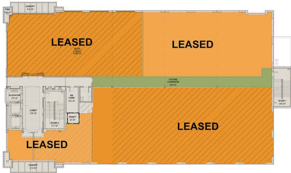
3RD FLOOR RSF's include a 13.4% load factor