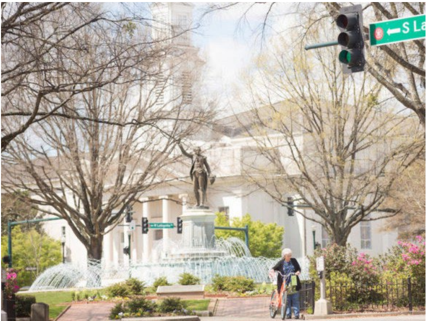
Lafayette Square, Downtown LaGrange, Georgia