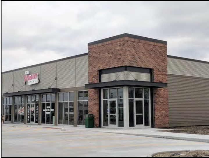
South End-cap space available