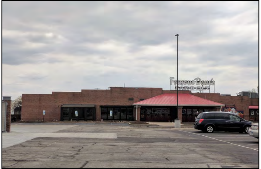
Restaurant space available, north end