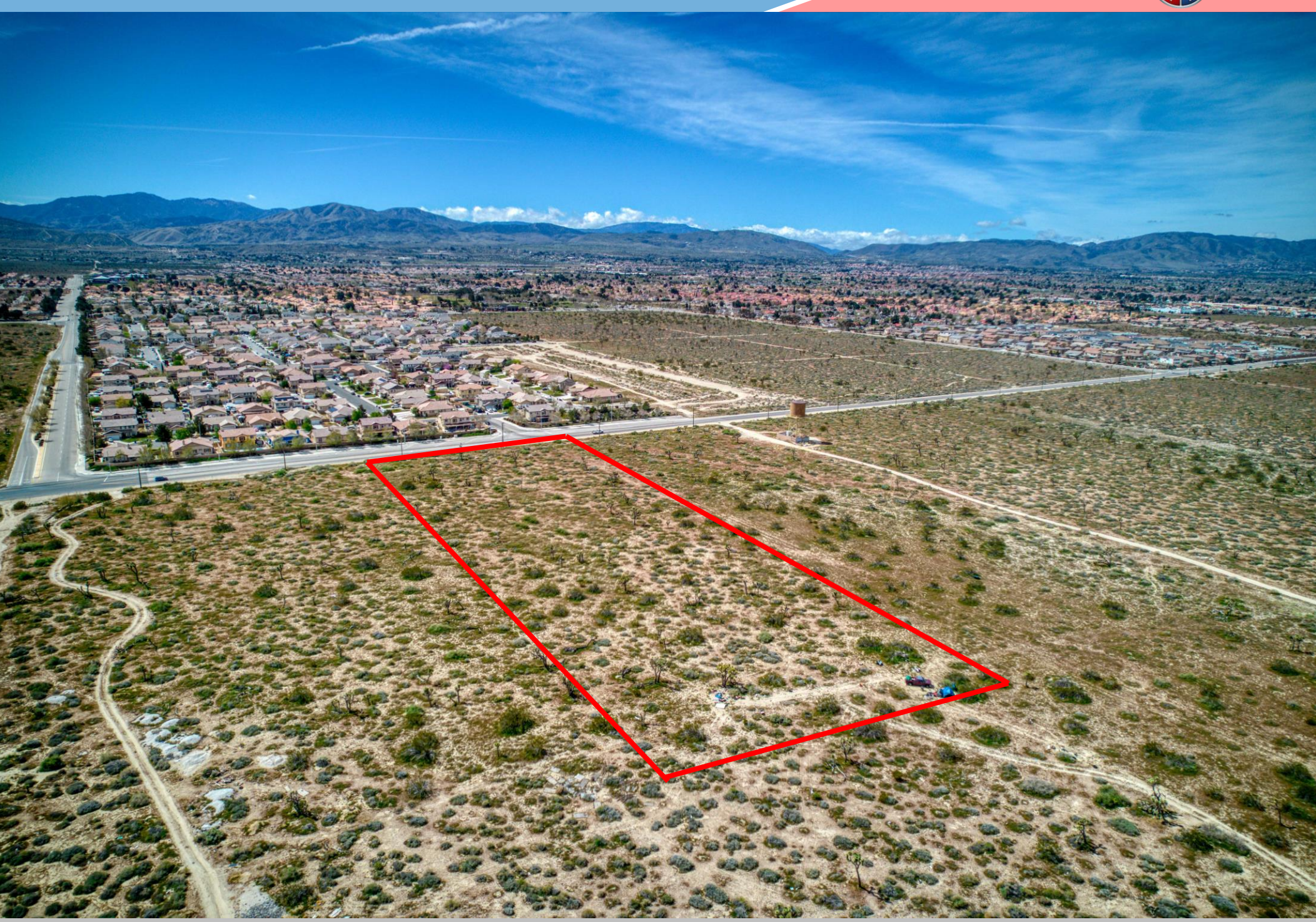
This information contained herein was obtained from sources deemed to be reliable; however Crissman Commercial Services, Inc. and RE/MAX of Santa Clarita make no guarantees, warranties or representations as to the completeness or accuracy thereof. | CA DRE #01013938