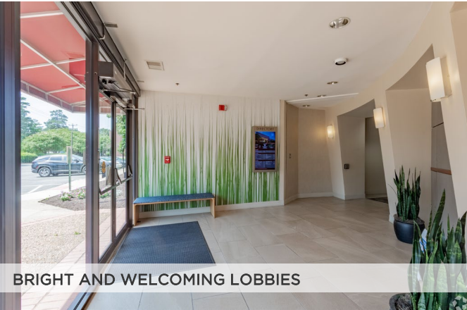
BRIGHT AND WELCOMING LOBBIES