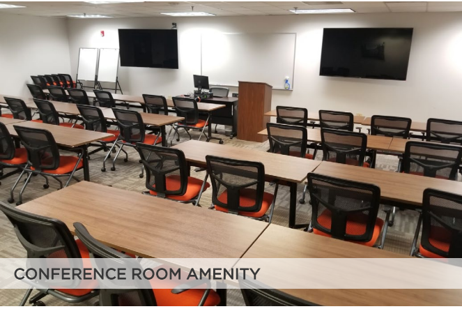
CONFERENCE ROOM AMENITY