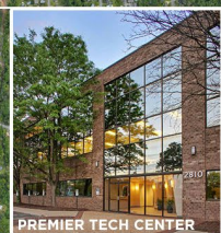
PREMIER TECH CENTER