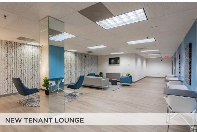
NEW TENANT LOUNGE