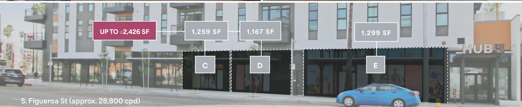
S. Figueroa St (approx. 28,800 cpd)