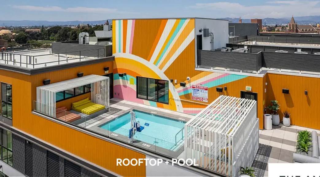
ROOFTOP + POOL