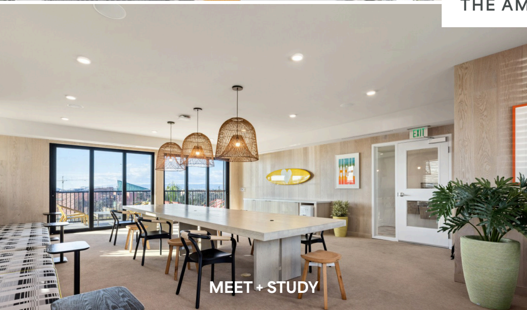
MEET + STUDY