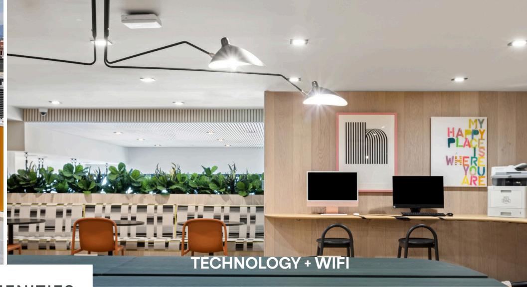
TECHNOLOGY + WIFI