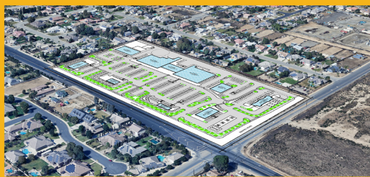
Rosedale Hwy & Renfro Rd

NWC - Rosedale Hwy & Renfro Rd Bakersfield, CA 93314