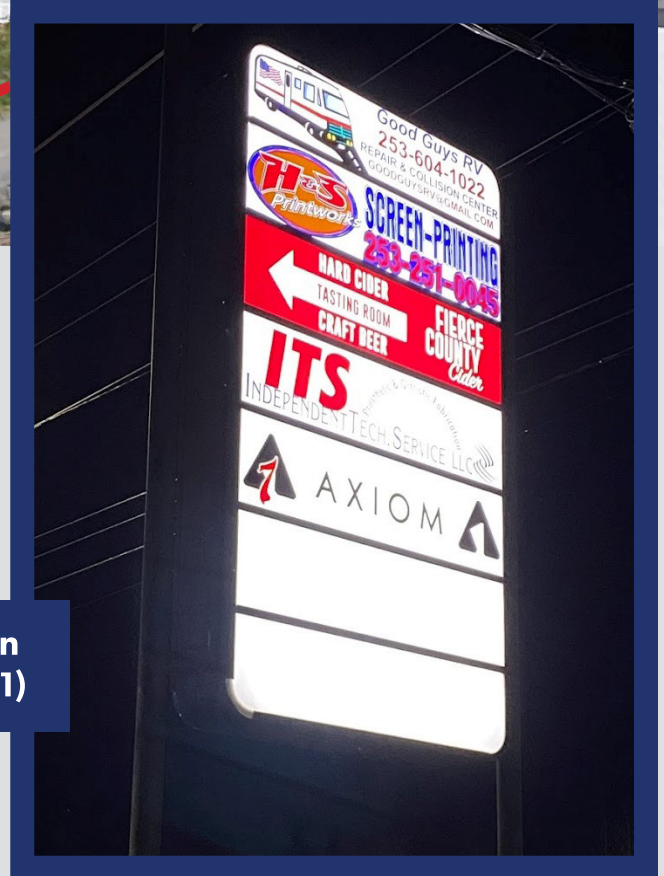
Monument sign on Meridian (Hwy-161)