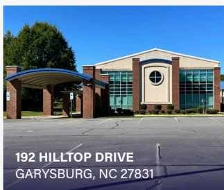
192 HILLTOP DRIVE GARYSBURG, NC 27831

Classrooms, meeting rooms, and gymnasium with upper-level running track.